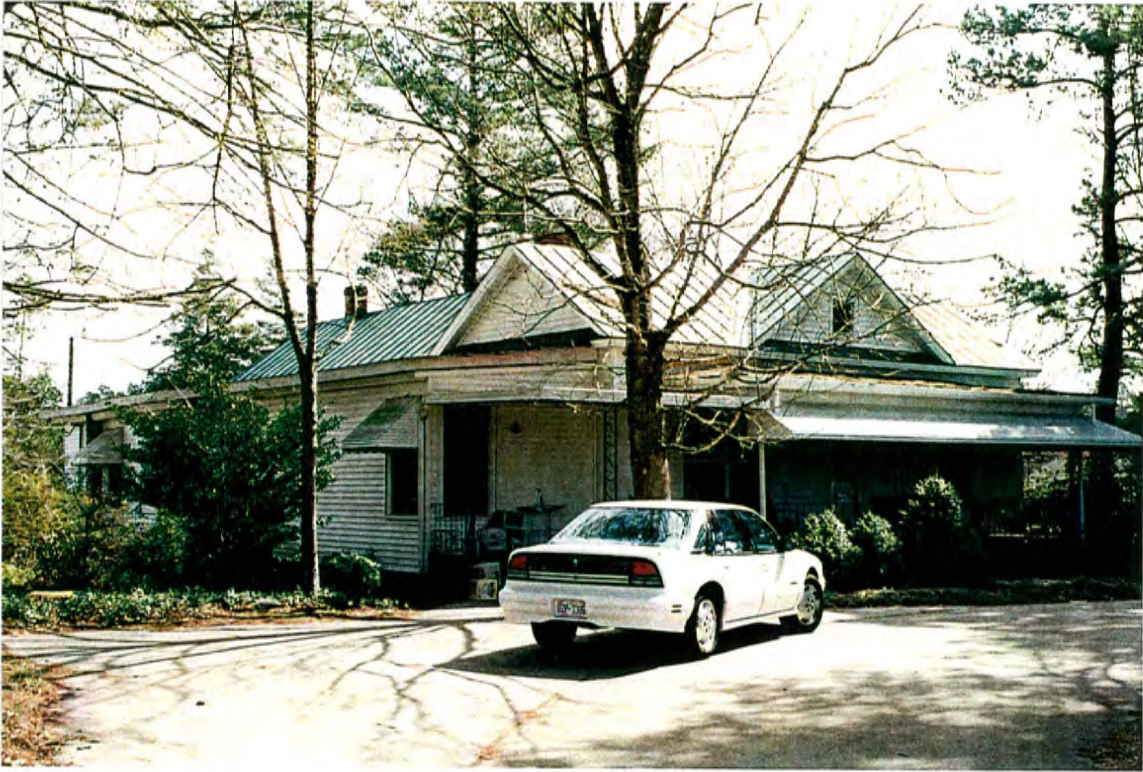
John Henry Poole House