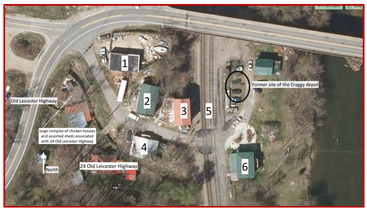
Craggy Historic District (BN6404) corrected map