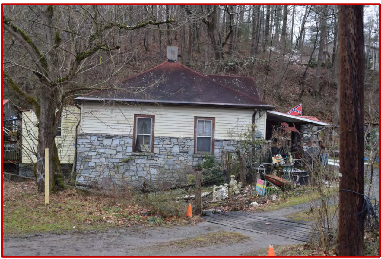
House at 24 Old Leicester Road, view to the south