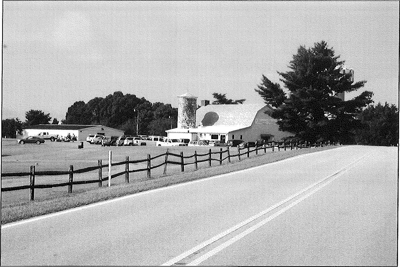
Resource A – 1518 Pleasant Ridge Road (at Pleasant Ridge Golf Course), Greensboro: