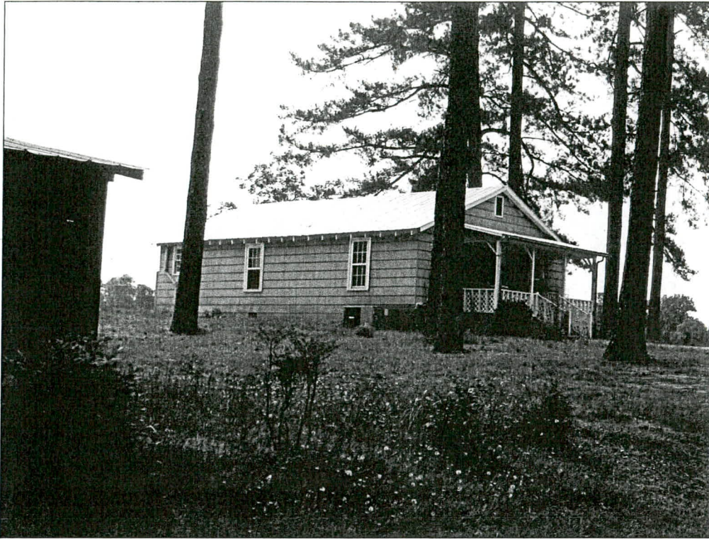
Plate 3: House at 910 Twyla Road—looking southeast from shed toward house