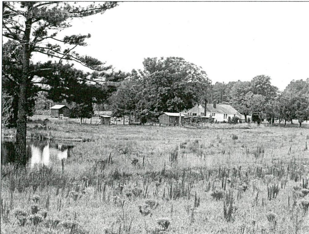
Plate 4: Farm at 7317 Green Hope School Road—looking southwest at north side and east rear elevations of house and outbuildings