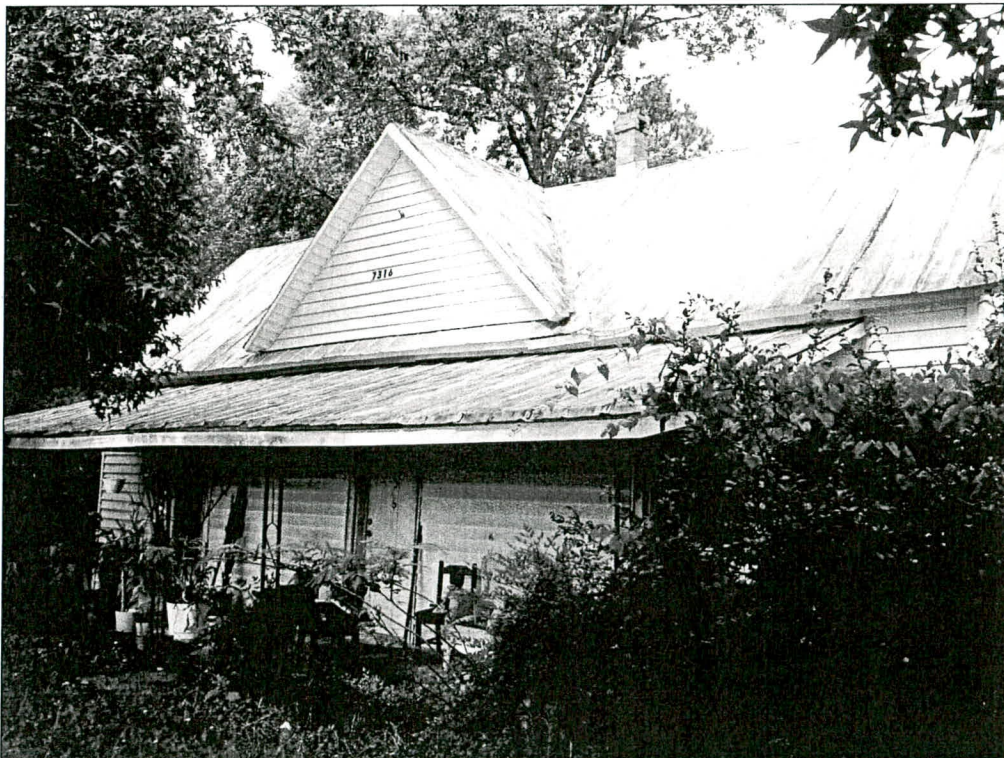
Plate 8: House at 7316 Green Hope School Road—east front elevation