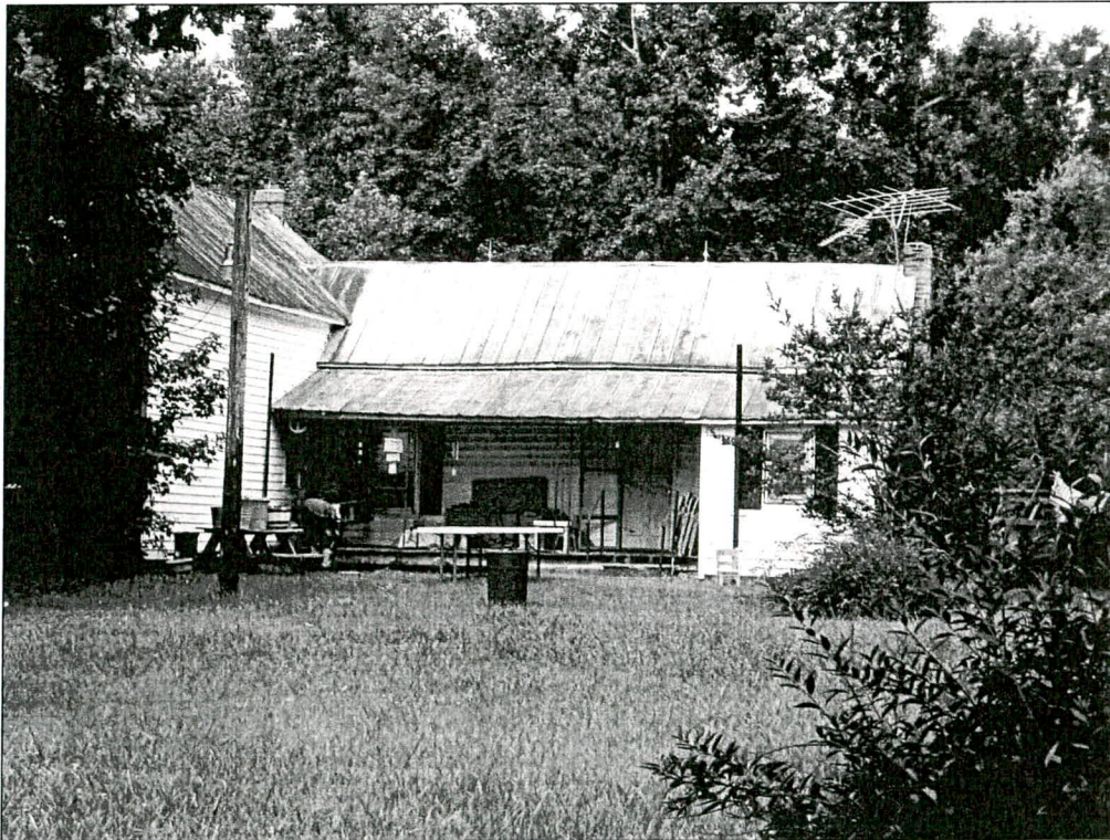
Plate 12: House at 7326 Green Hope School Road— east front elevation of