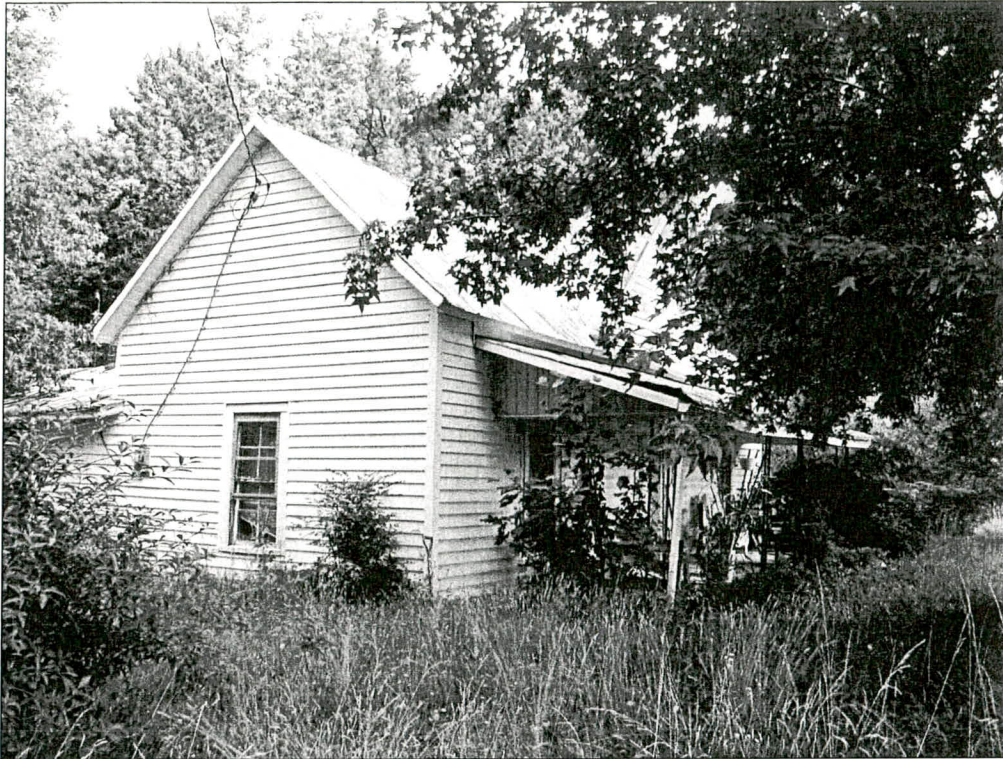
Plate 7: House at 7316 Green Hope School Road—south side and east front elevations