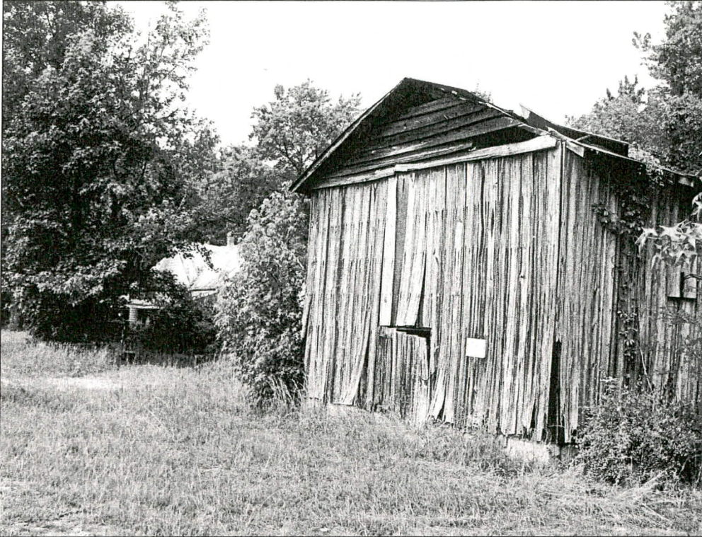
Plate 9: House at 7316 Green Hope School Road—south side and east front elevations of outbuilding; house at left