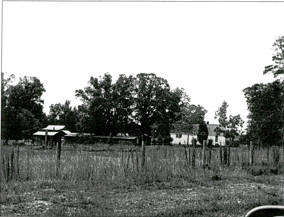
Plate 5: Farm at 7317 Green Hope School Road—looking south at north side elevations of house and outbuildings