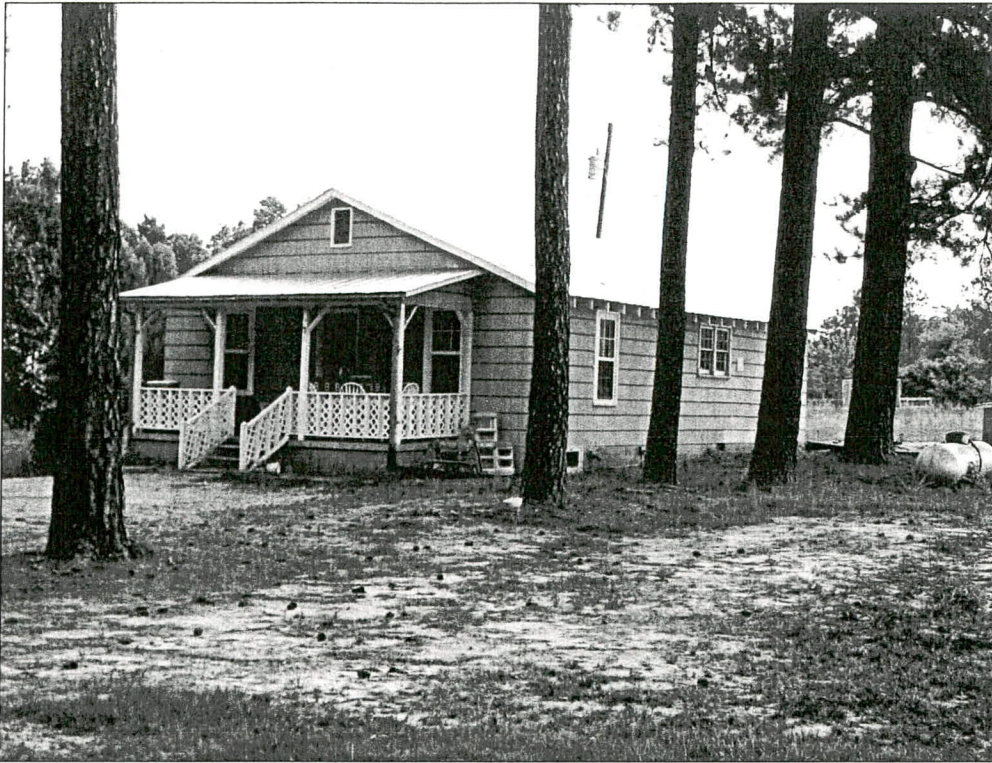
Plate 1: House at 910 Twyla Road—west front and south side elevations