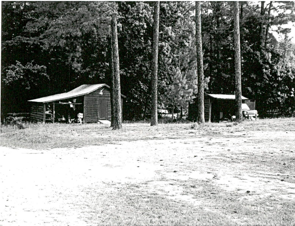
Plate 2: House at 910 Twyla Road—looking northeast at sheds to north of house