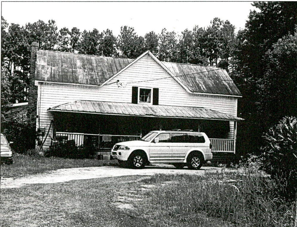
Plate 10: House at 7326 Green Hope School Road—south front and west side elevations