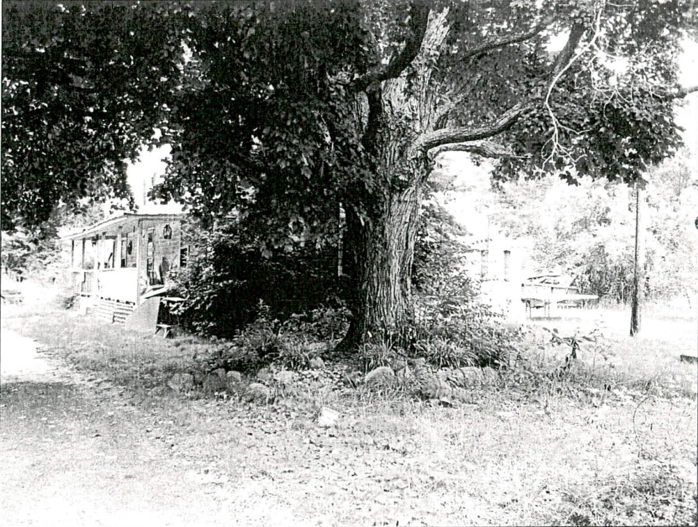
Plate 11: House at 7326 Green Hope School Road—south front elevation at left and rear ell at right