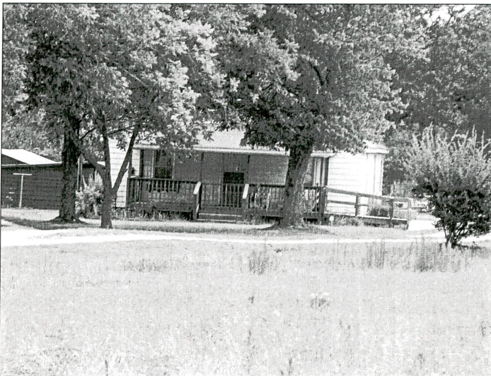
Plate 6: Farm at 7317 Green Hope School Road—looking northeast at west front and south side elevations of house and shed