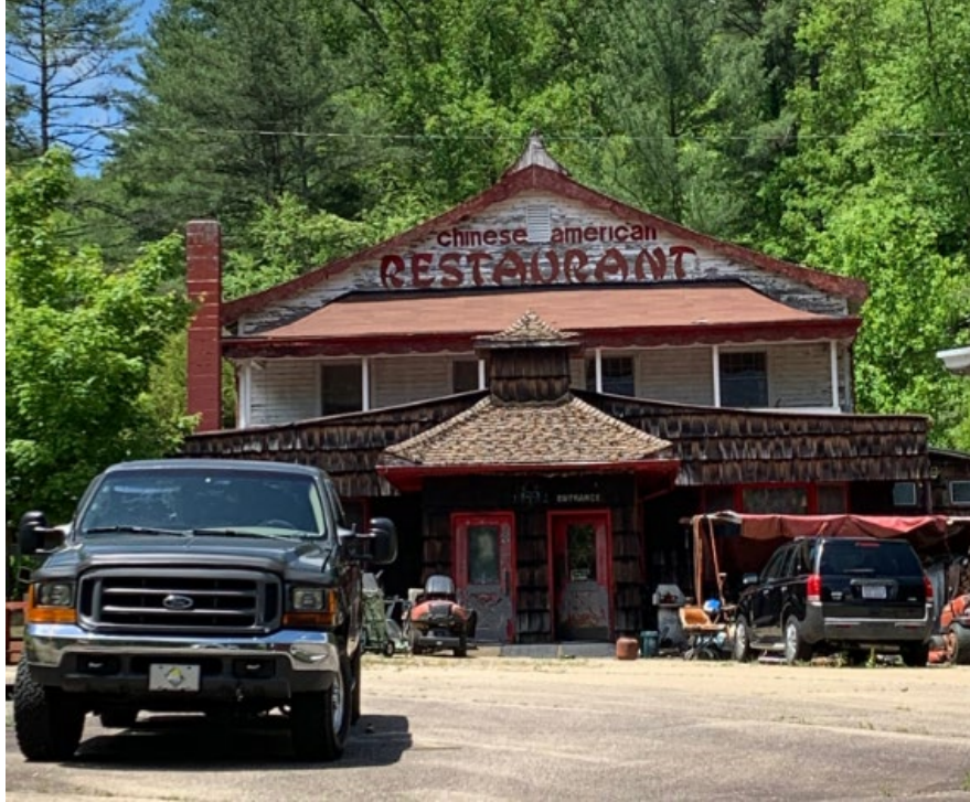
Beam's Restaurant (NCDOT Survey May 2019)