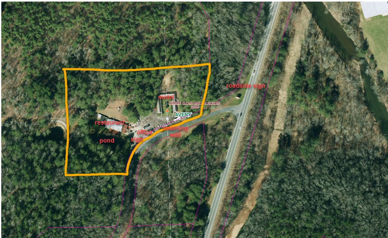
Beam's Motel and Restaurant (AV0084) site plan and historic boundary

Beam's frame restaurant was erected in 1937 by James Ramey and Essie Ollis Beam and in the late 1940s they constructed the concrete block and brick veneer office. The motel motor court was constructed of similar materials in the mid 1950s. In 1993 the widow Essie Beam sold the property to Richard and Brenda Eng who operated the restaurant as Beam's Chinese-American Restaurant until 2004. In the 2005 evaluation report, the historic boundary excludes a large portion of the wooded parcel and did not include the roadside sign. I recommend a similar boundary with clarification that the boundary follow the existing edge of pavement along SR 1191 (River Hall Road) so as not to intersect with the foundations of the office, retaining wall, and restaurant sign.