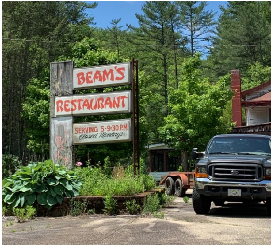
Beam's Restaurant Sign (NCDOT Survey May 2019)