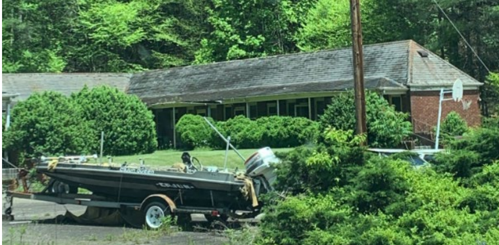
Beam's Motel (NCDOT Survey May 2019)

The Sunny Brook Store site consists of four structures- a 1937 two-story, frame store, a 1950 one-and-one-half story, stucco, frame dwelling, a circa 1930s frame, banked outbuilding and a mobile home installed on the rise behind the outbuilding in 1992. The resources sit within a 1.22 acre parcel and the historic boundaries follow the existing parcel lines which appear to extend into the road along the west side of US 19E.