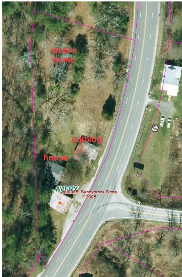
Sunny Brook Store (AV0085) site plan and parcel boundary

The Sunny Brook Store site consists of four structures- a 1937 two-story, frame store, a 1950 one-and-one-half story, stucco, frame dwelling, a circa 1930s frame, banked outbuilding and a mobile home installed on the rise behind the outbuilding in 1992. The resources sit within a 1.22 acre parcel and the historic boundaries follow the existing parcel lines which appear to extend into the road along the west side of US 19E.