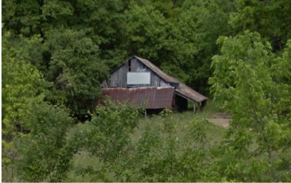
R.L. Hall Log Barn