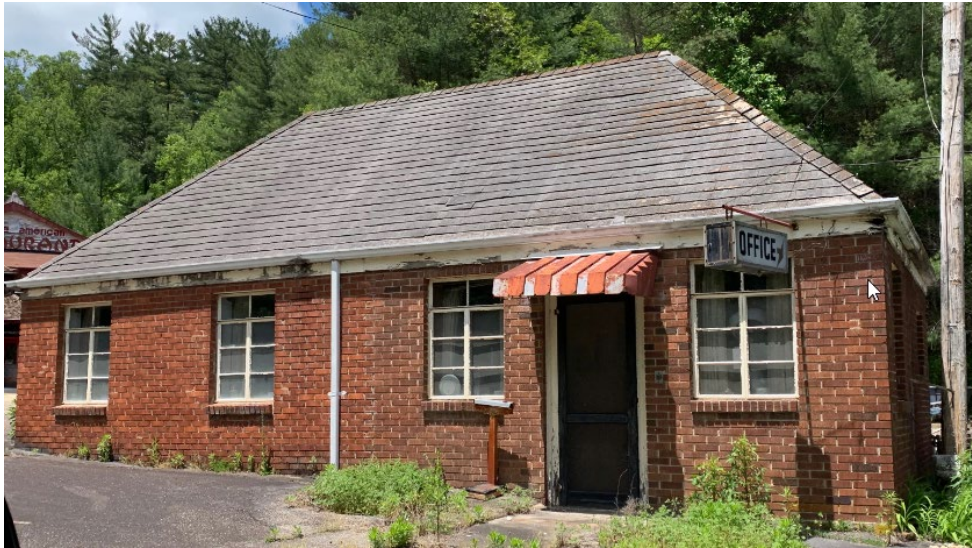
Beam's Motel Office (NCDOT Survey May 2019)