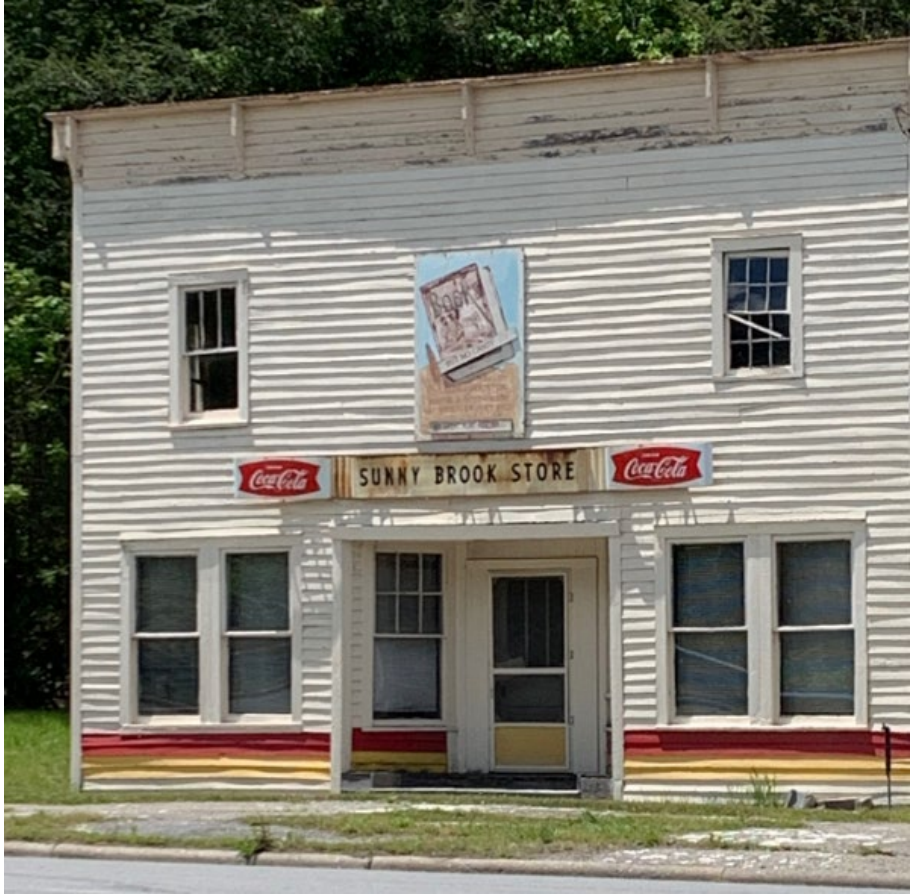
Sunny Brook Store (NCDOT Survey May 2019)