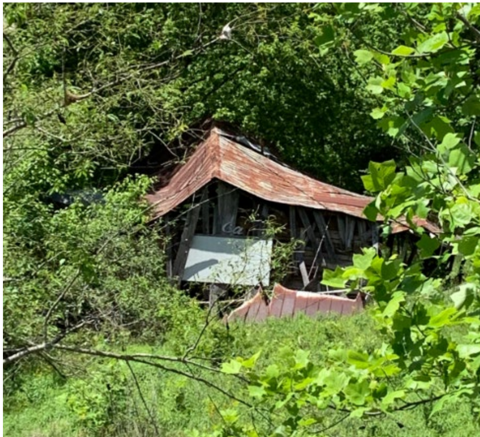
R.L. Hall Log Barn (NCDOT Survey May 2019)