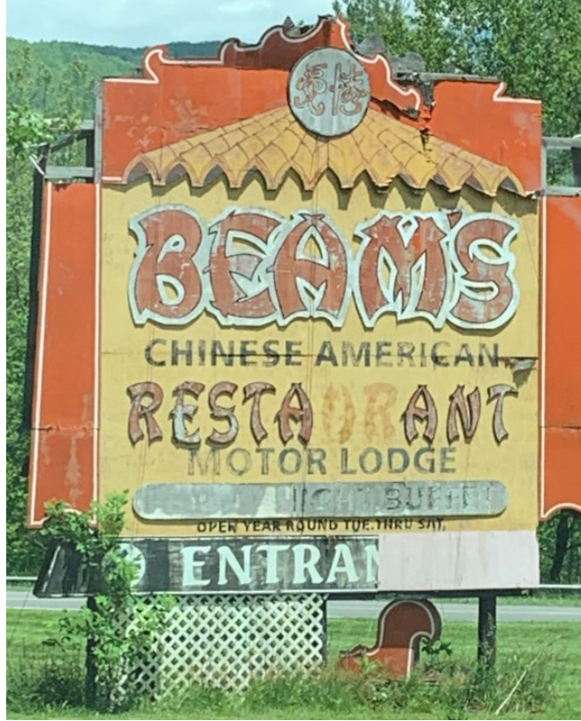
Beam's Roadside Sign (NCDOT Survey May 2019)