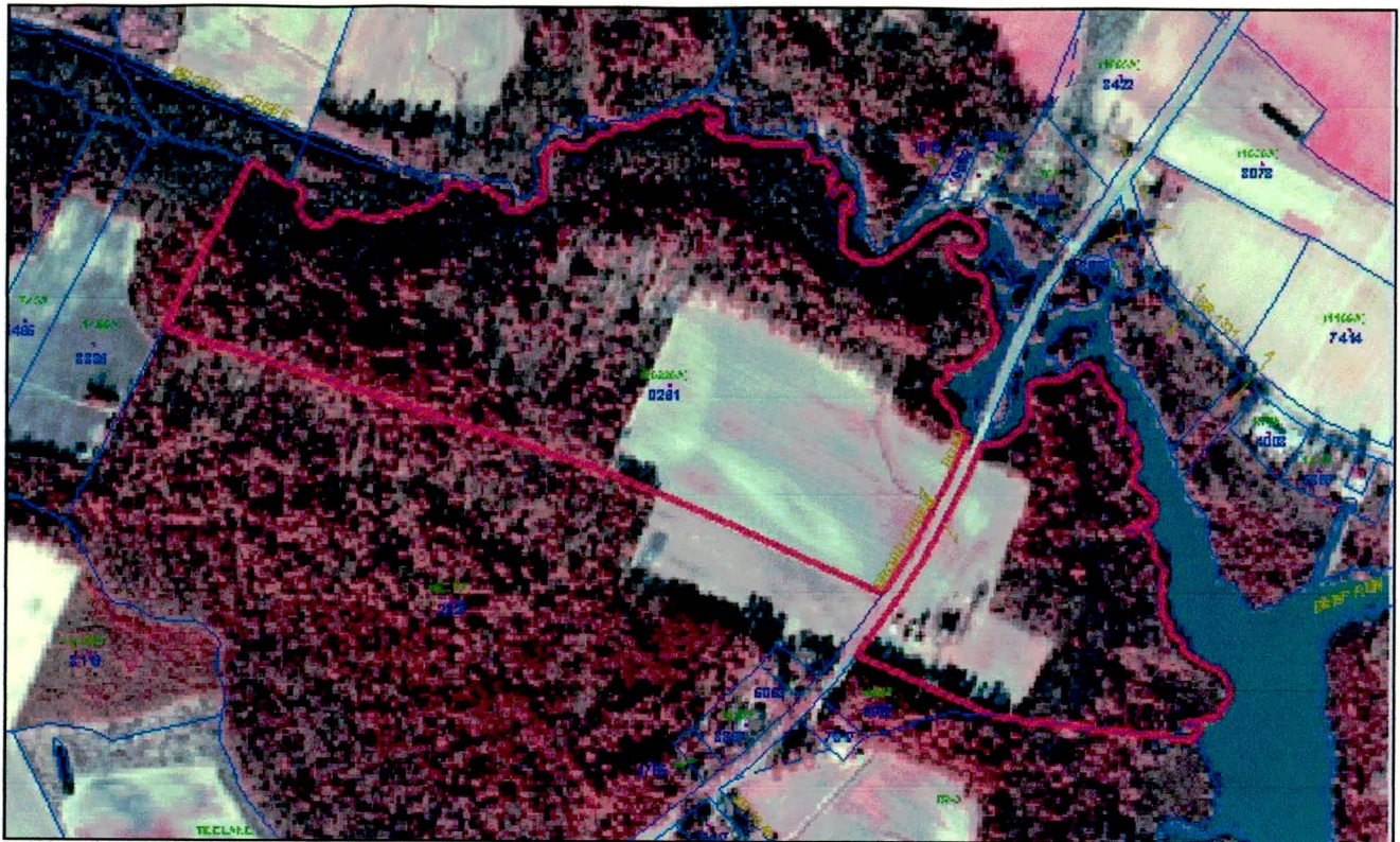
Candy-Allgood Farm tax map, tax parcel no. 6604-47-0261. Parcel boundary and National Register boundary are shown in red.