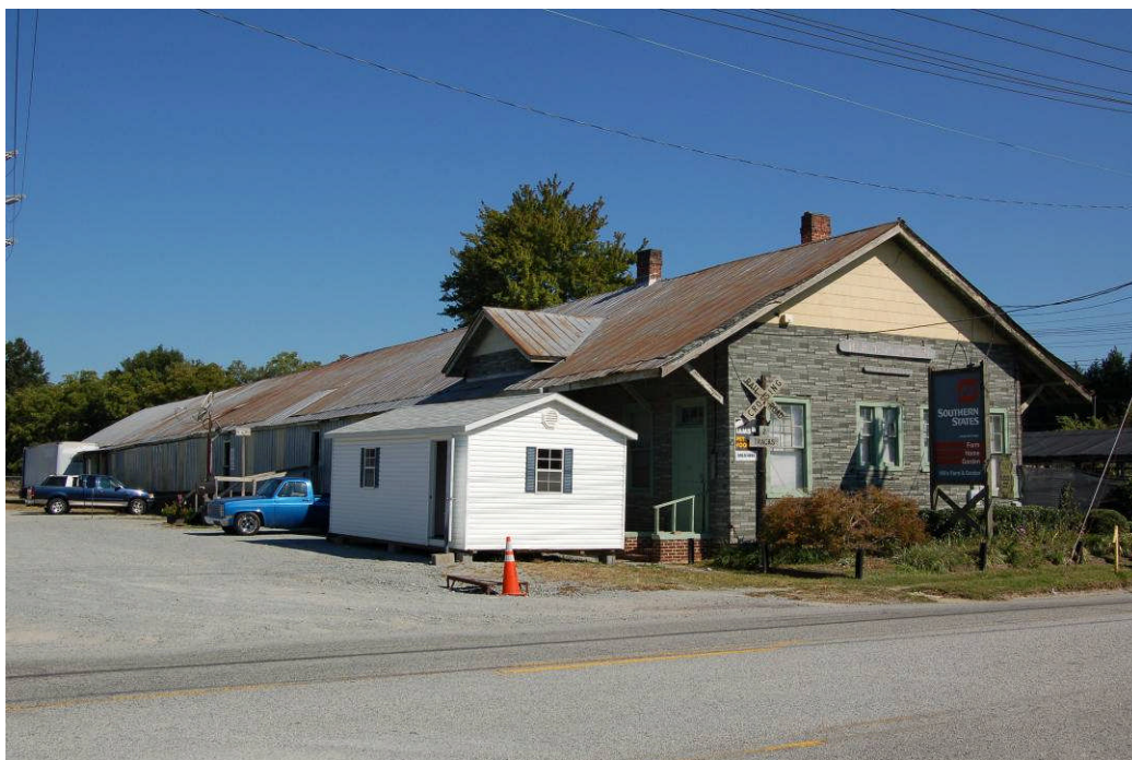
Carolina and Yadkin River Railroad Depot, 215 Randolph Street