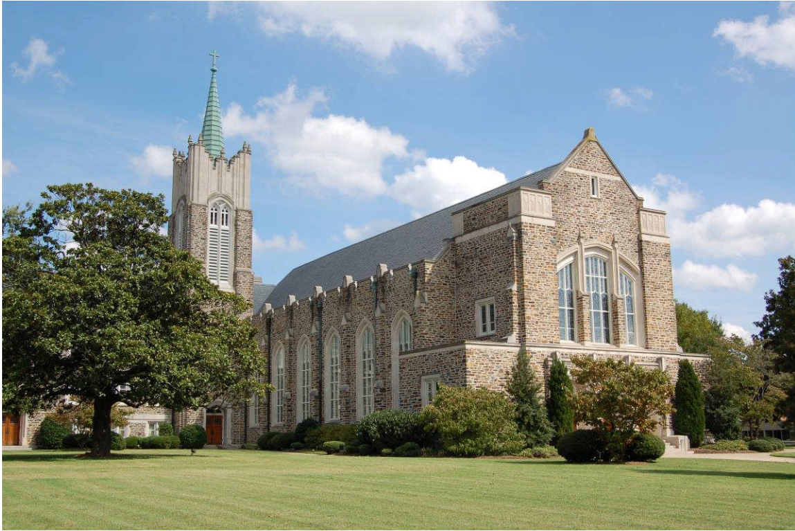
Memorial Methodist Church, 101 Randolph Street