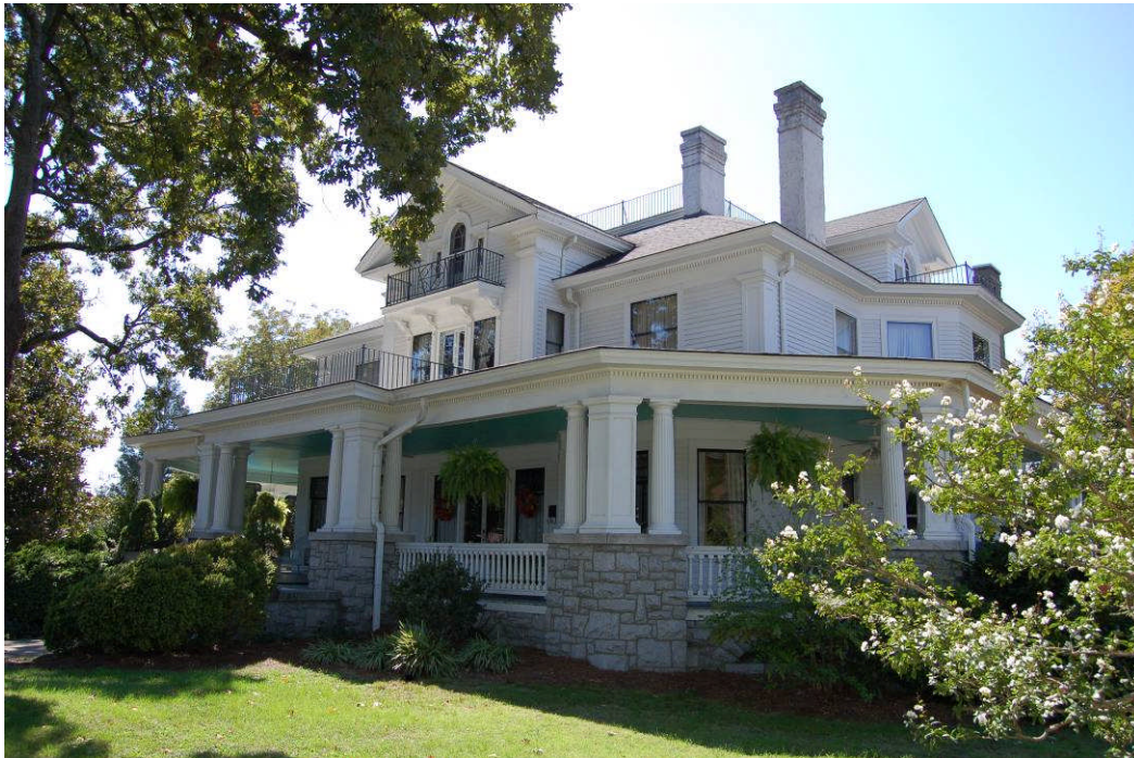
Frank S. Lambeth House, 100 Randolph Street