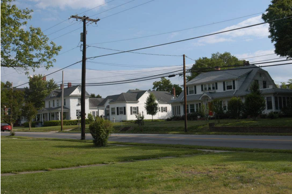
202-208 Salem Street