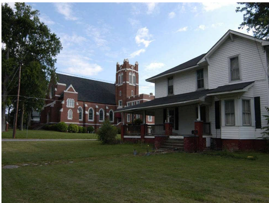
118 and 200 Salem Street