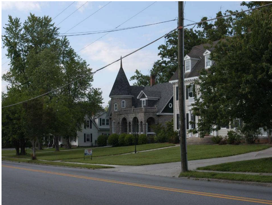
207-215 Salem Street