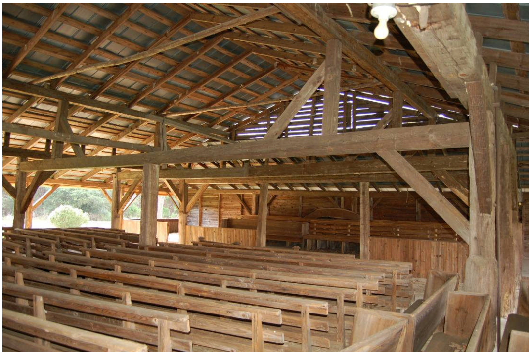
View toward north end platform