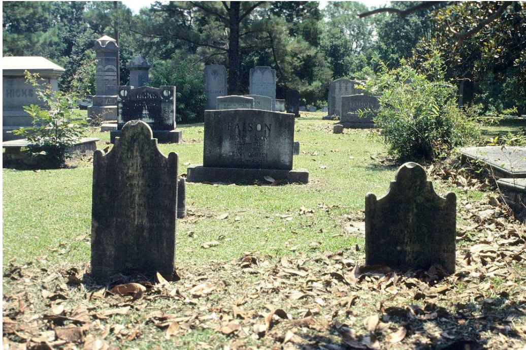
View of oldest graves