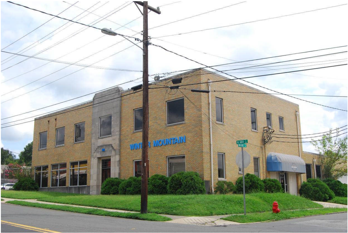
Royal Crown Bottling Company, 319-321 E. Geer Street