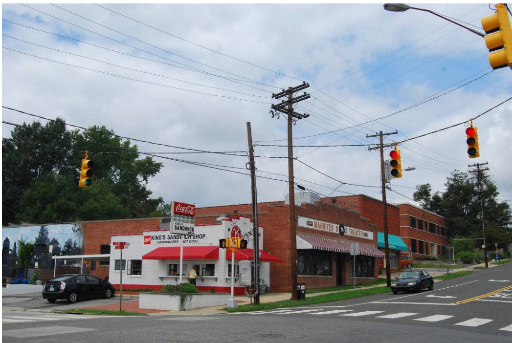
700 Block of Foster Street, view looking northwest