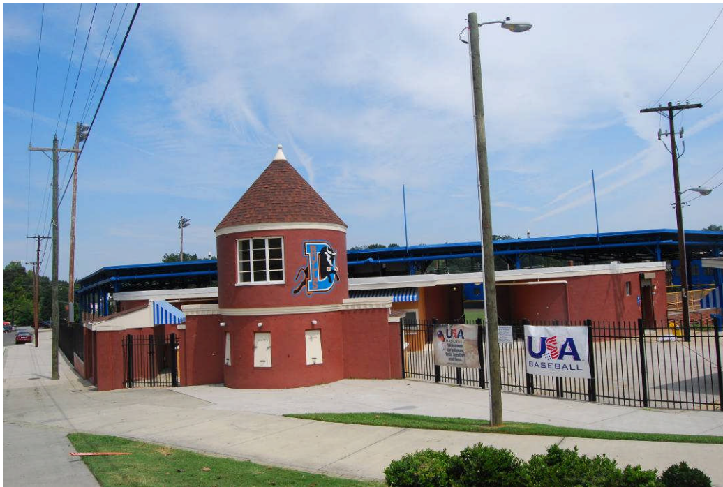
Durham Athletic Park, 500 Washington Street, view looking north

Photographs by M. Ruth Little, August 2012