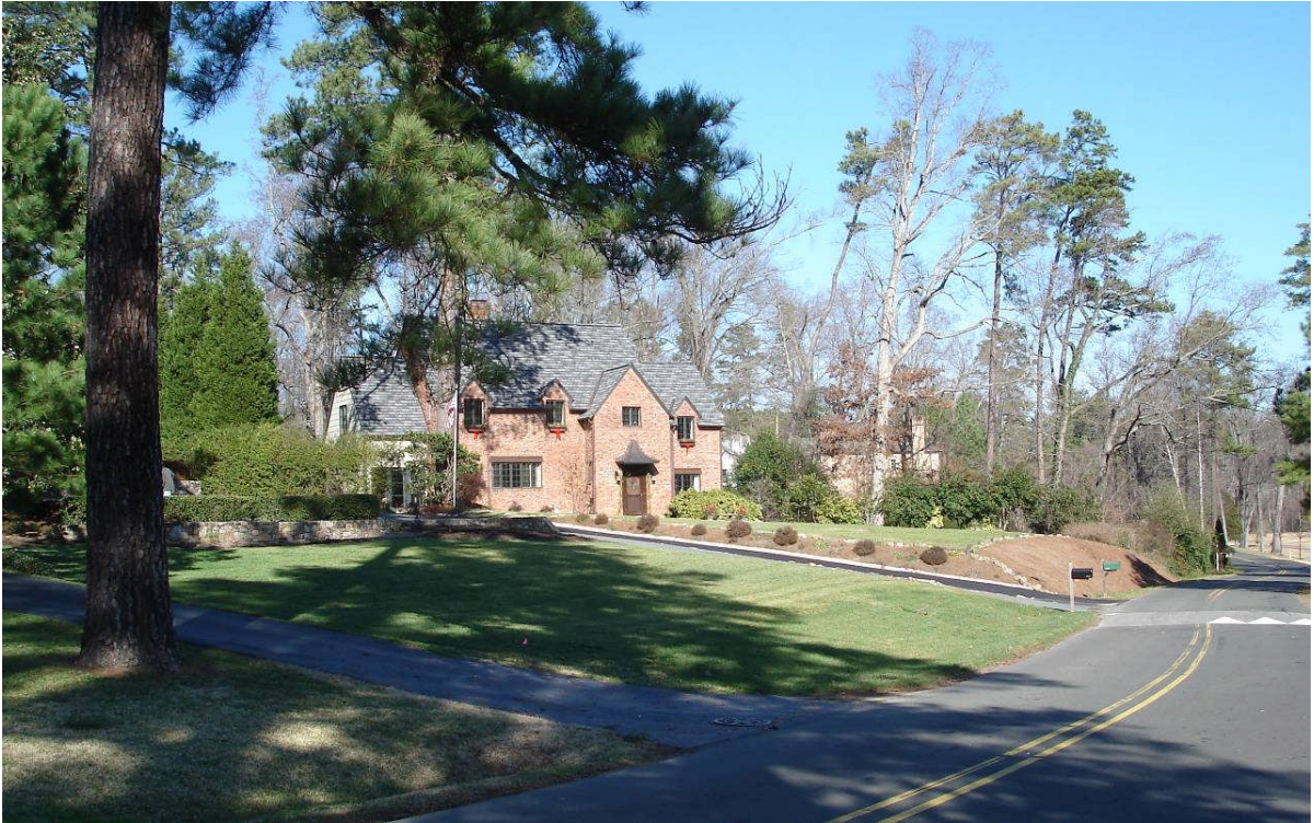
Cheek-Waller House, Dover Road