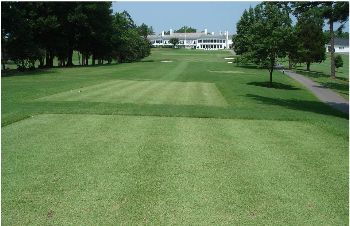
18 th Hole, Hope Valley Country Club Golf Course