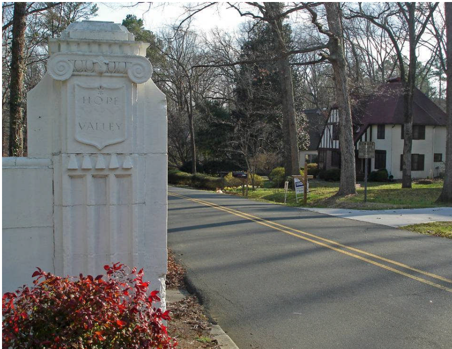
Dover Road Entrance Gate

Photographs by Cynthia de Miranda, March 2008