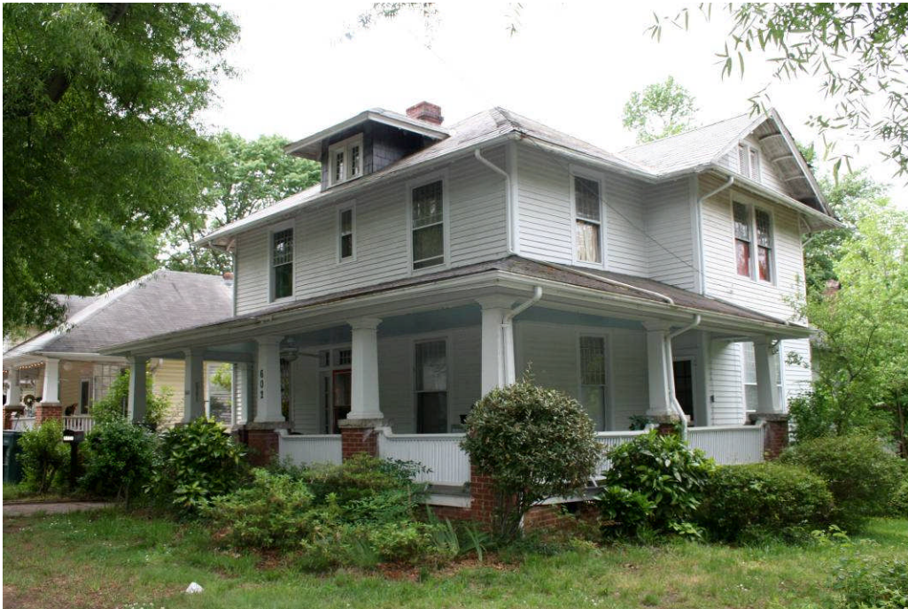
C. T. Miles House, 612 Gattis Street