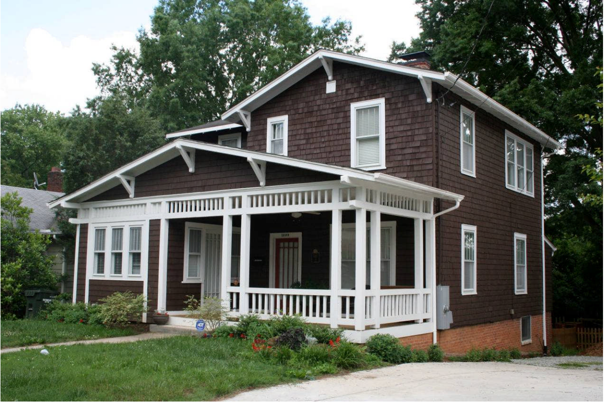
M. Webb Thompson House, 1009 Burch Avenue