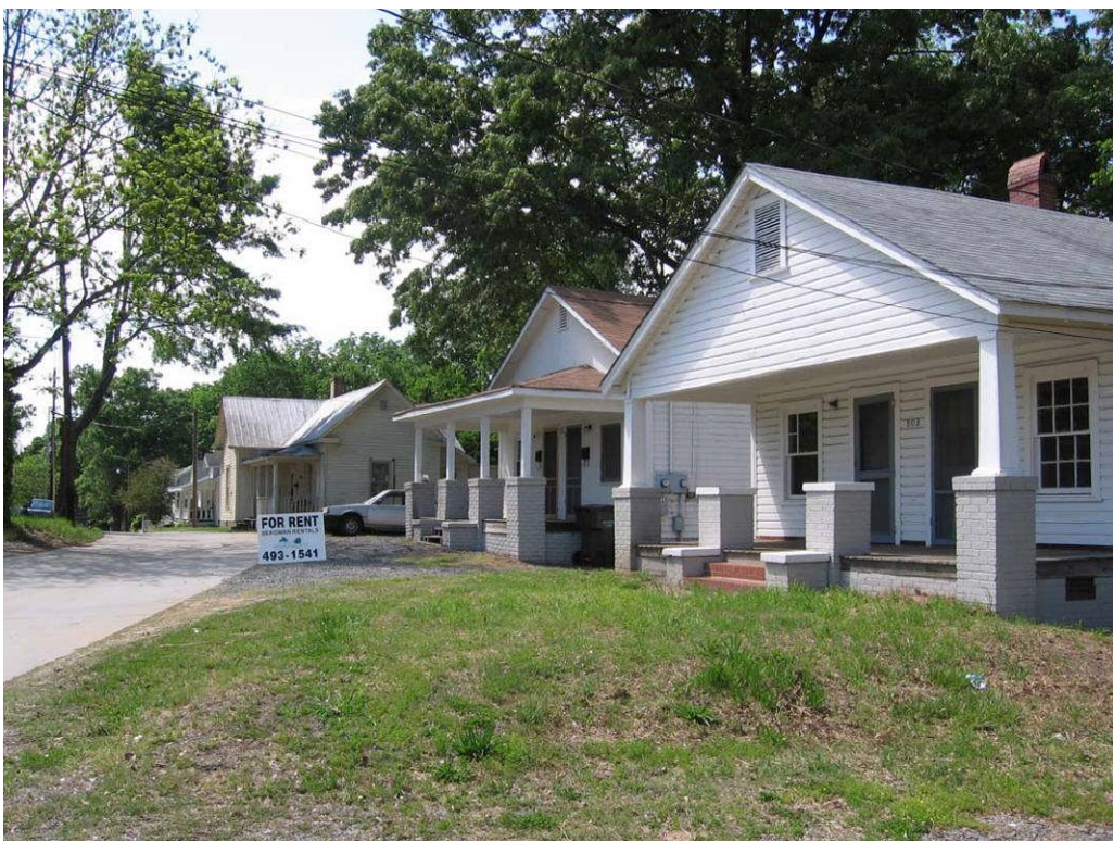
808-814 Exum Street