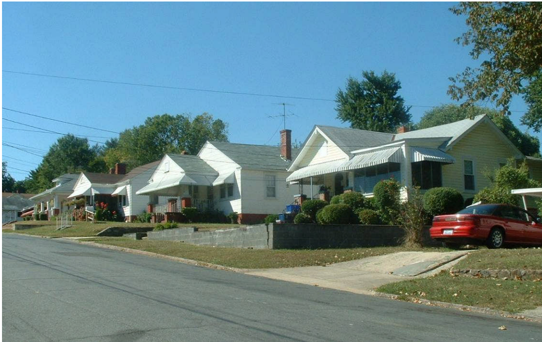
600 Block of Price Street, north side

Photographs by Heather Wagner, September 2005 and December 2009