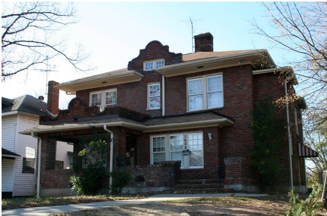
Dr. Charles H. Shepard House, 1608 Fayetteville Street