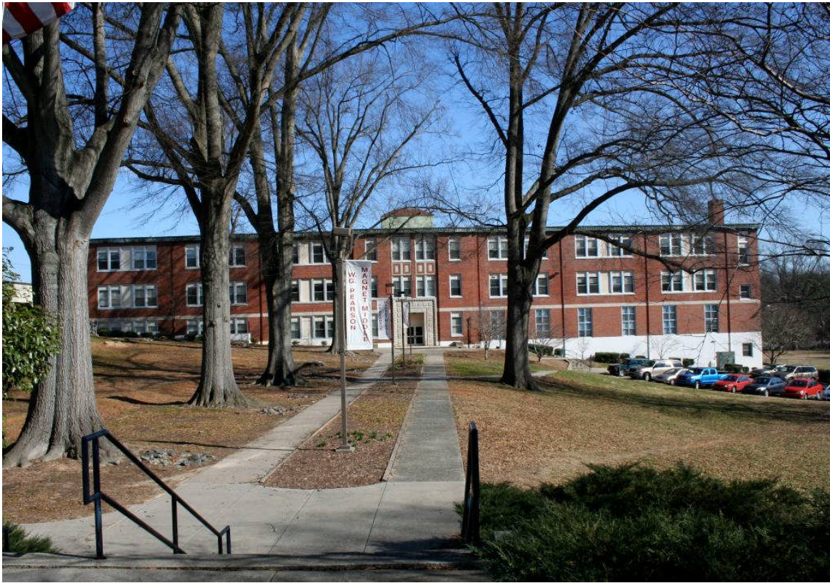
W. G. Pearson Elementary School, 600 East Umstead Street