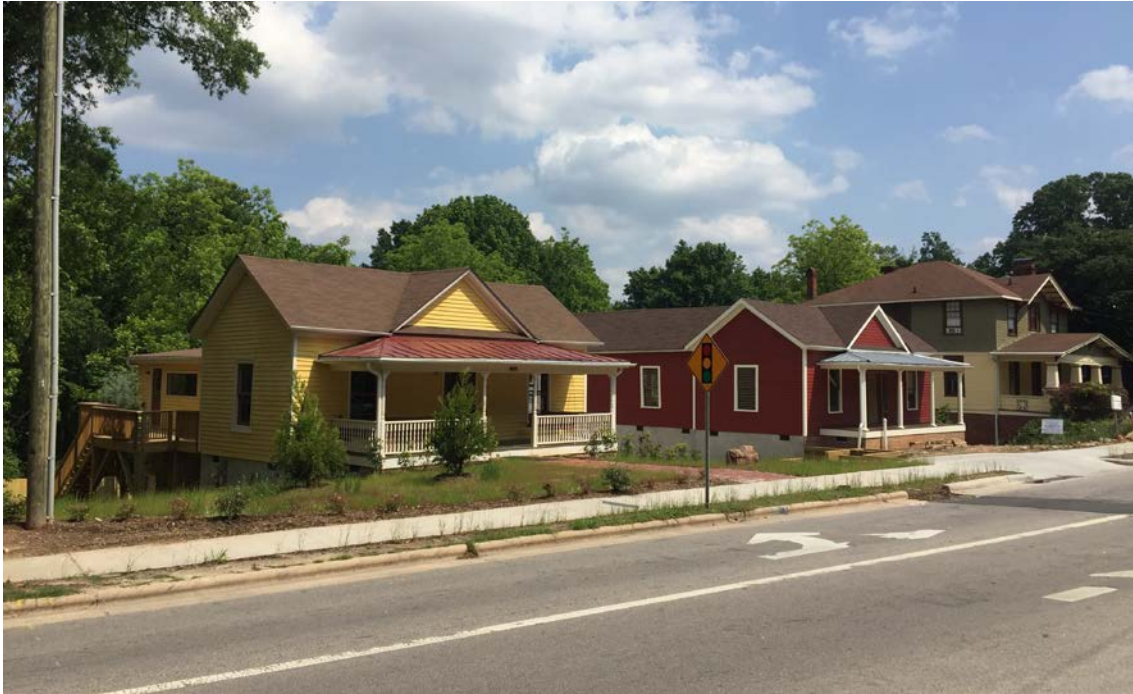
803 and 807 Vickers Avenue