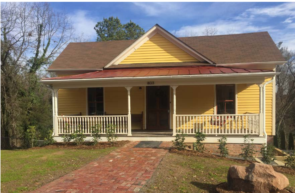
803 Vickers Avenue