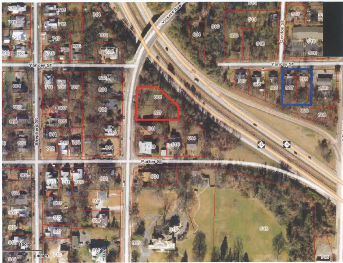
Original location in blue, and new location in red