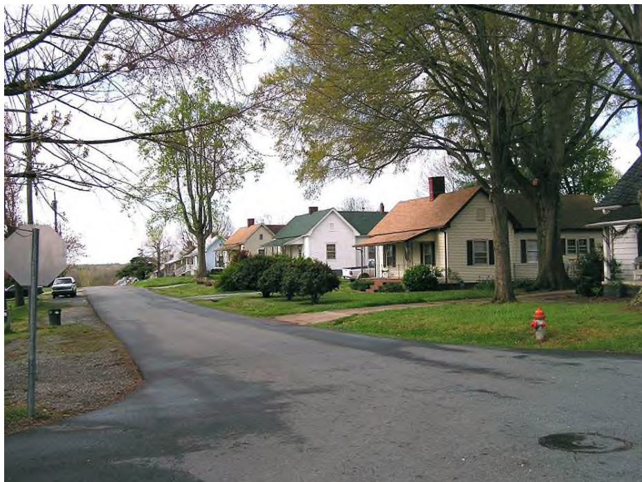
Watt Street, looking south from Cross Street