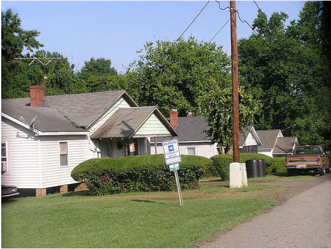
Hickory Street, looking northwest