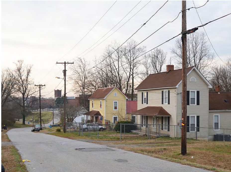
View down Grove Street to mill