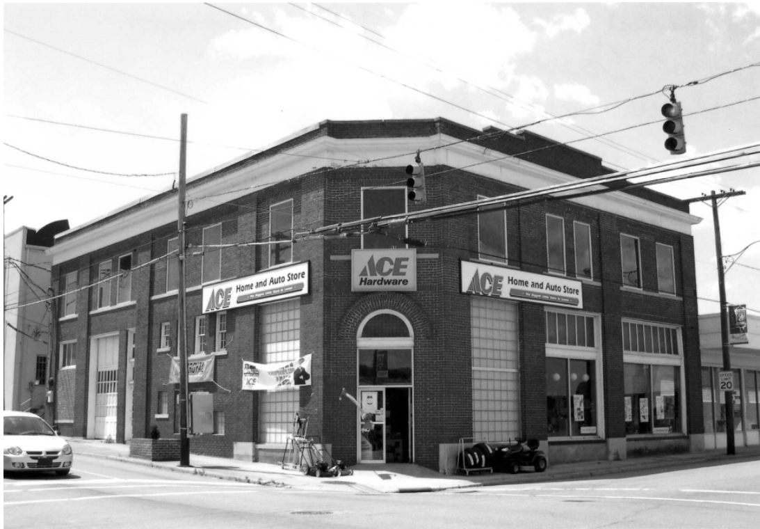
101 West Mulberry Street