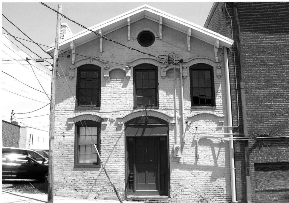
Courtney Warehouse, 212 Church Street