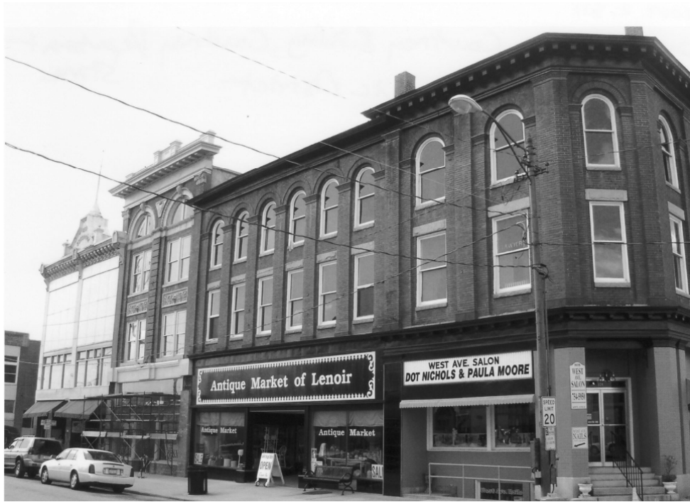
Lenoir Building, Courtney Building, Courtney Department Store

Lenoir, Caldwell County, CW0105, Listed 9/5/2007 Nomination by Heather Fearnbach Photographs by Clay Griffith, April 2006