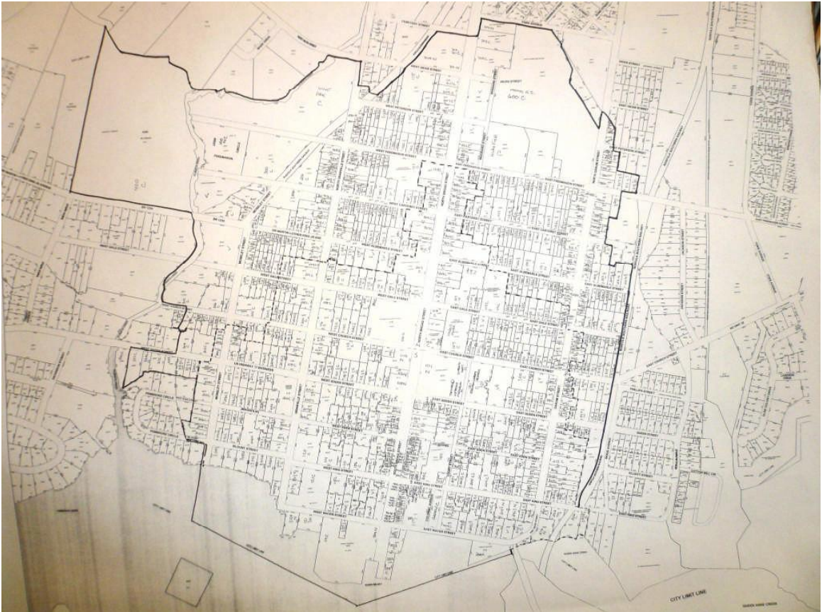
Historic District map