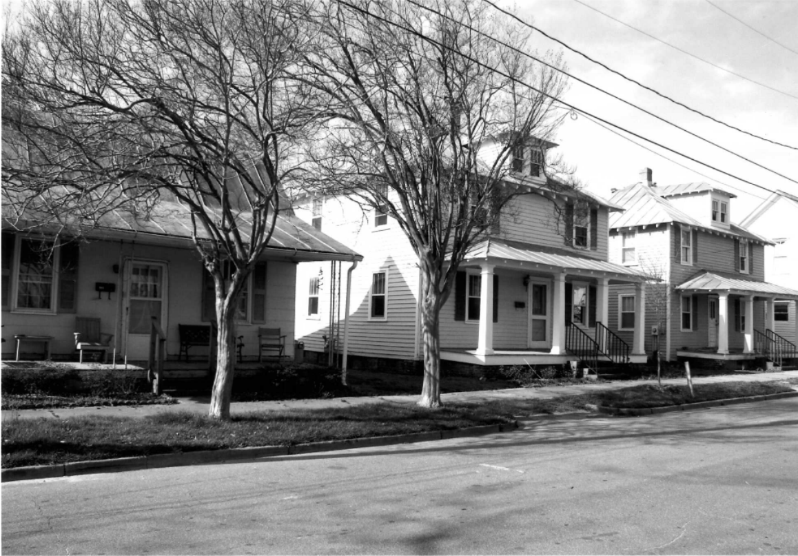
300 Block of East Queen Street, south side