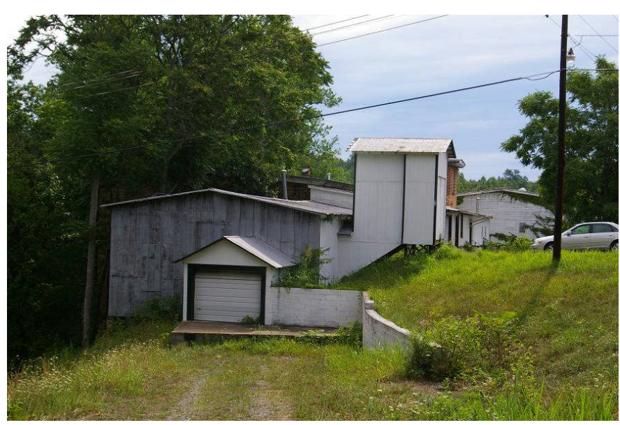
Overall view from the west