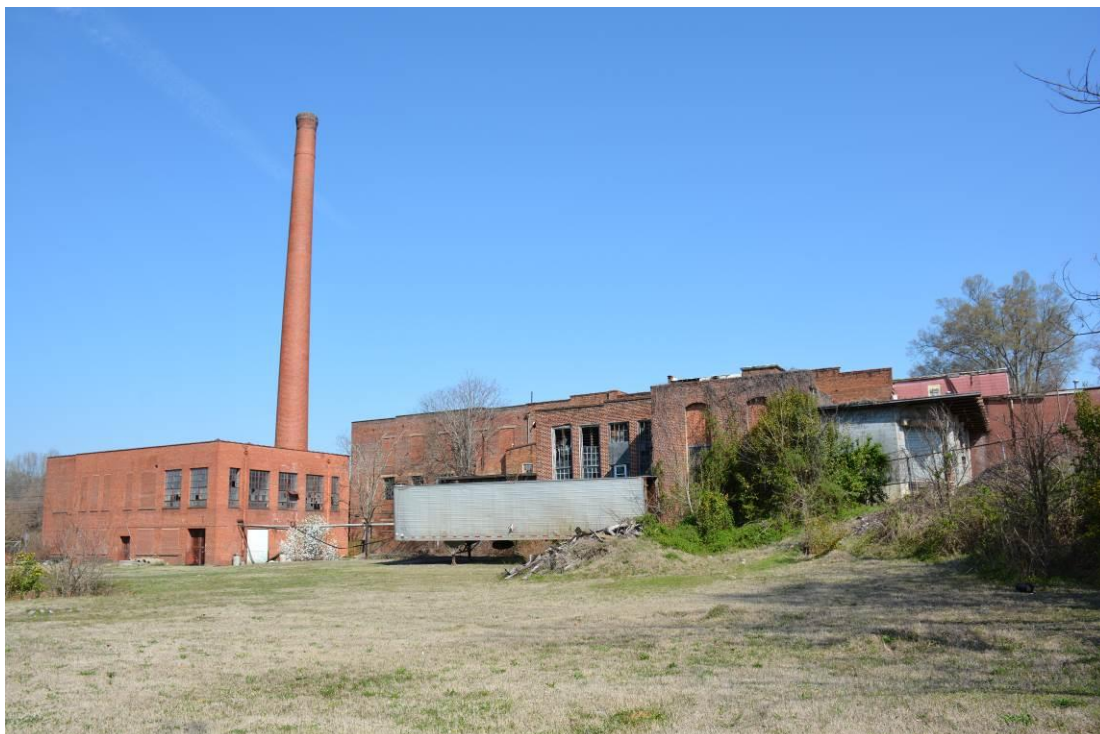
West elevation, looking northeast