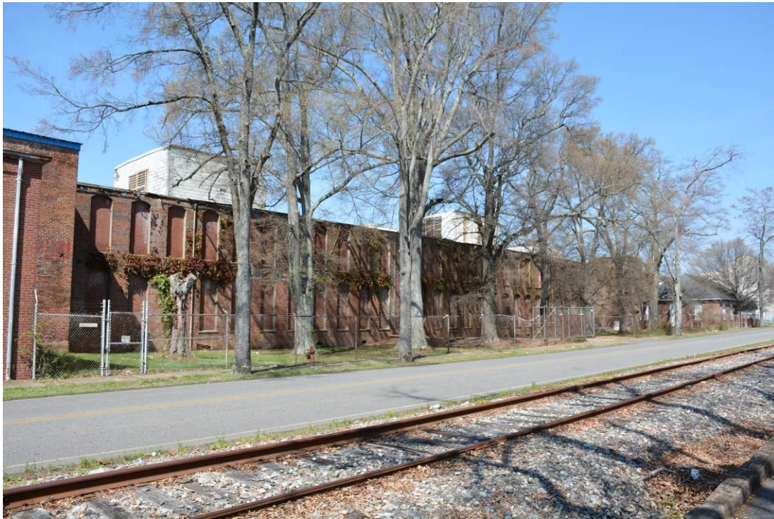
East elevation, looking northwest

Photographs by Heather Fearnbach, March 2015