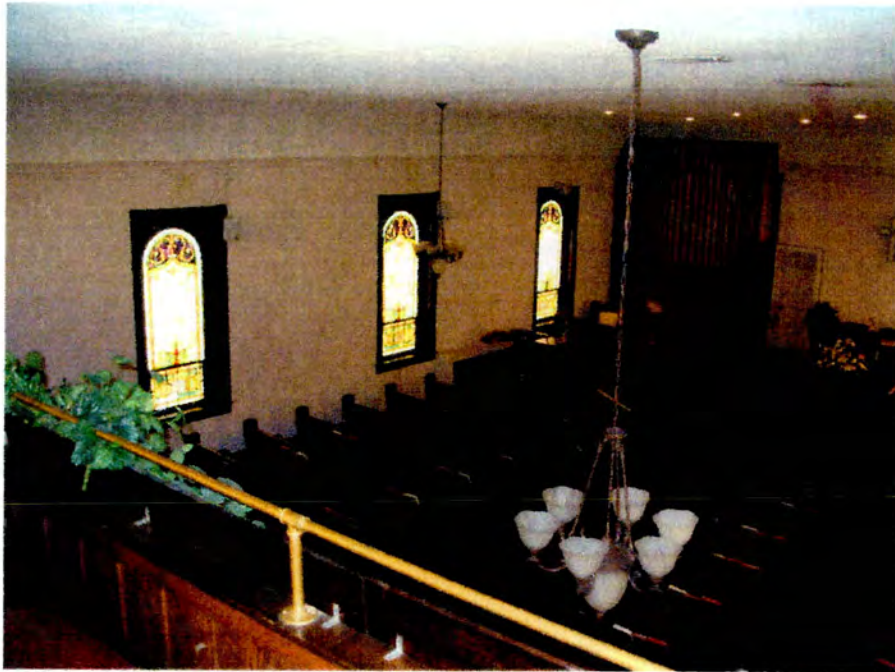
Haywood Street United Methodist Church, Sanctuary Interior, View of Sanctuary From Balcony.