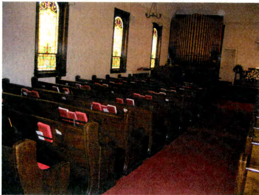
Haywood Street United Methodist Church, Sanctuary Interior, Detail of Pews.