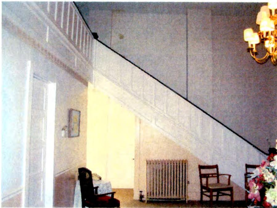
Haywood Street United Methodist Church, 1917 Educational Building Behind Sanctuary.