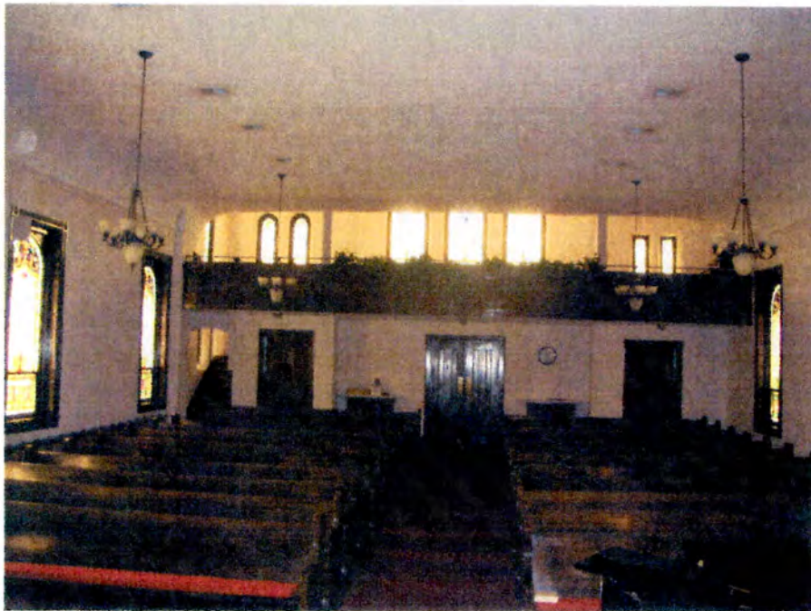
Haywood Street United Methodist Church, Sanctuary Interior, Looking Towards Entrance and Balcony.