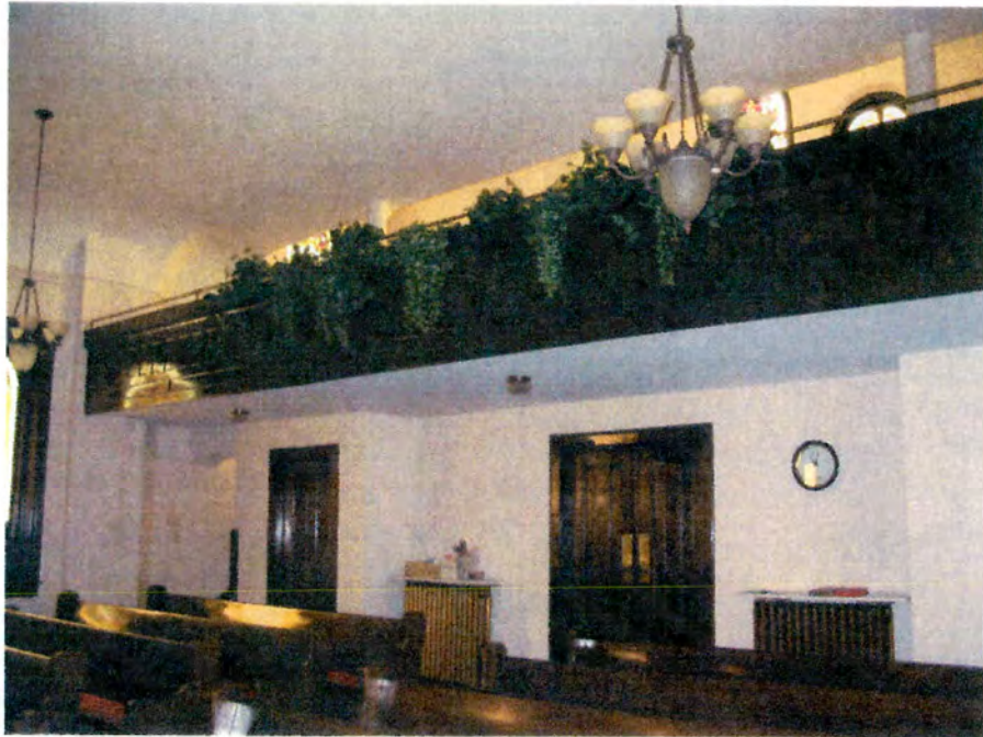
Haywood Street United Methodist Church, Sanctuary Interior, Detail of Doors and Balcony.