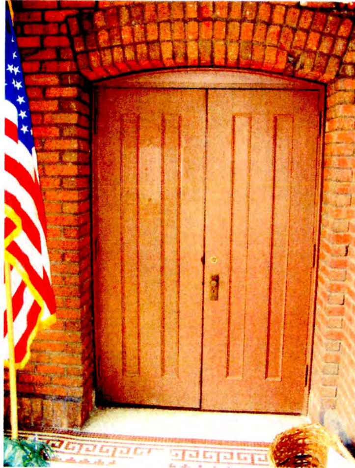
Haywood Street United Methodist Church, Detail of Main Entrance.