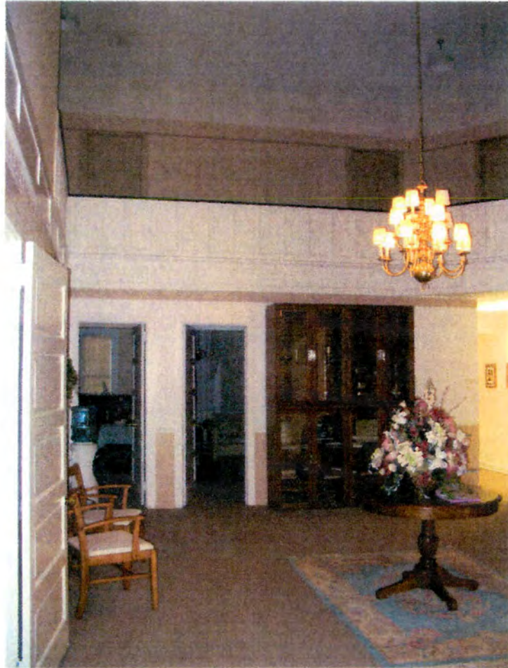
Haywood Street United Methodist Church, 1917 Educational Building Behind Sanctuary.