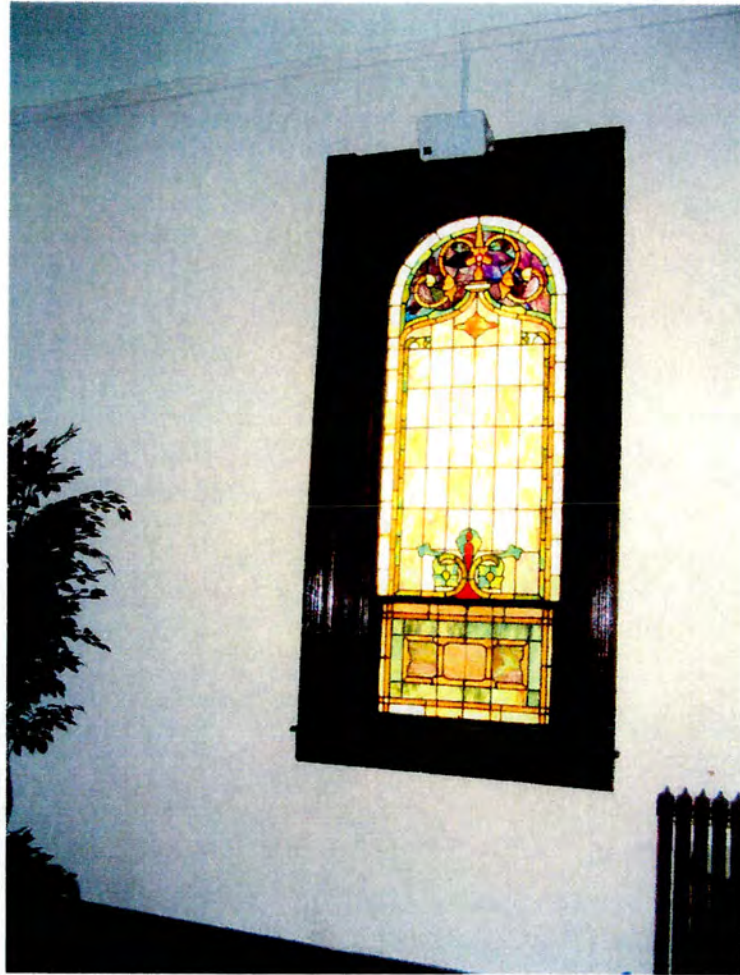
Haywood Street United Methodist Church, Sanctuary Interior, Detail of Stained Glass Window.