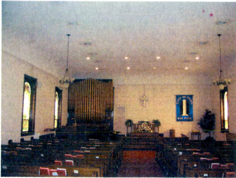
Haywood Street United Methodist Church, Sanctuary Interior, Looking Towards Altar and Choir.