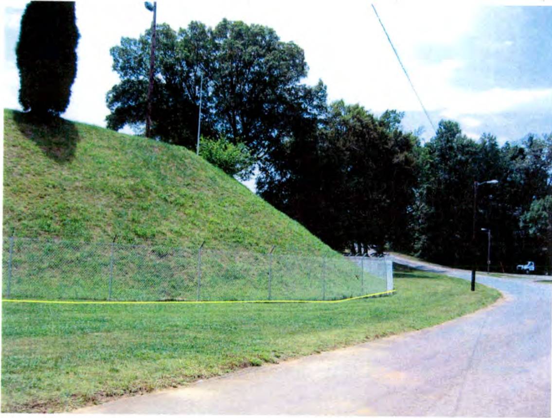
Figure 11: Facing southwest with the slope of the bank between the stadium and floodplain to the left; revised boundary is yellow