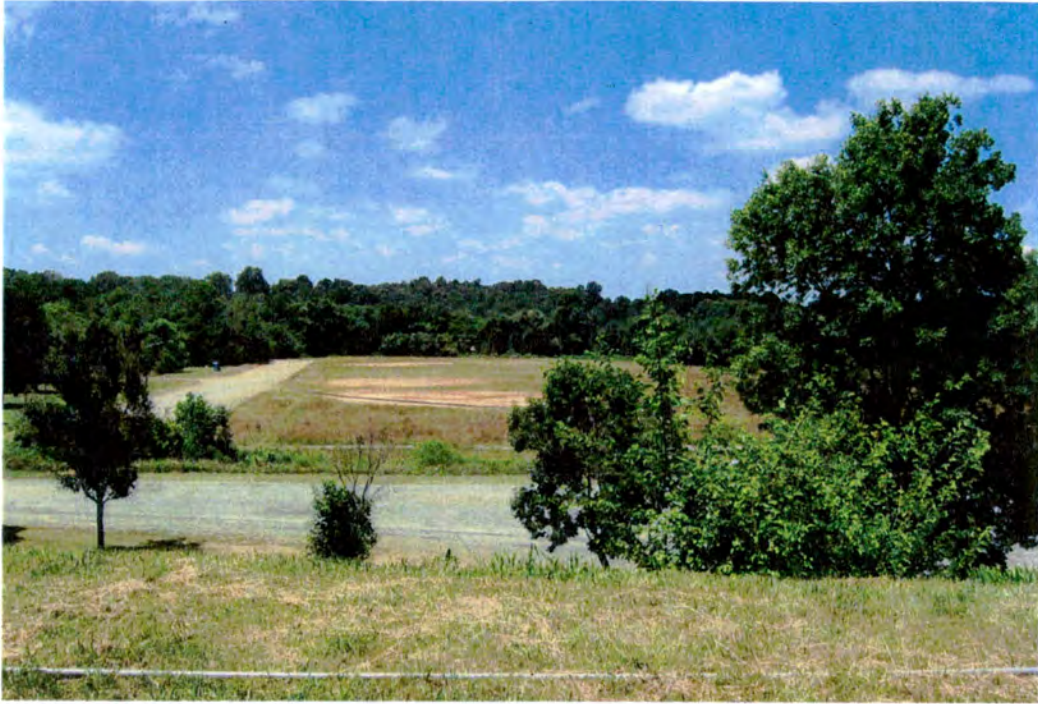
Figure 19: Facing west from top of bank at the proposed revised boundary's northwest corner