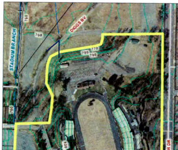
Figure 12: Map indicating direction photographer was facing; photographer was standing at the point of the V