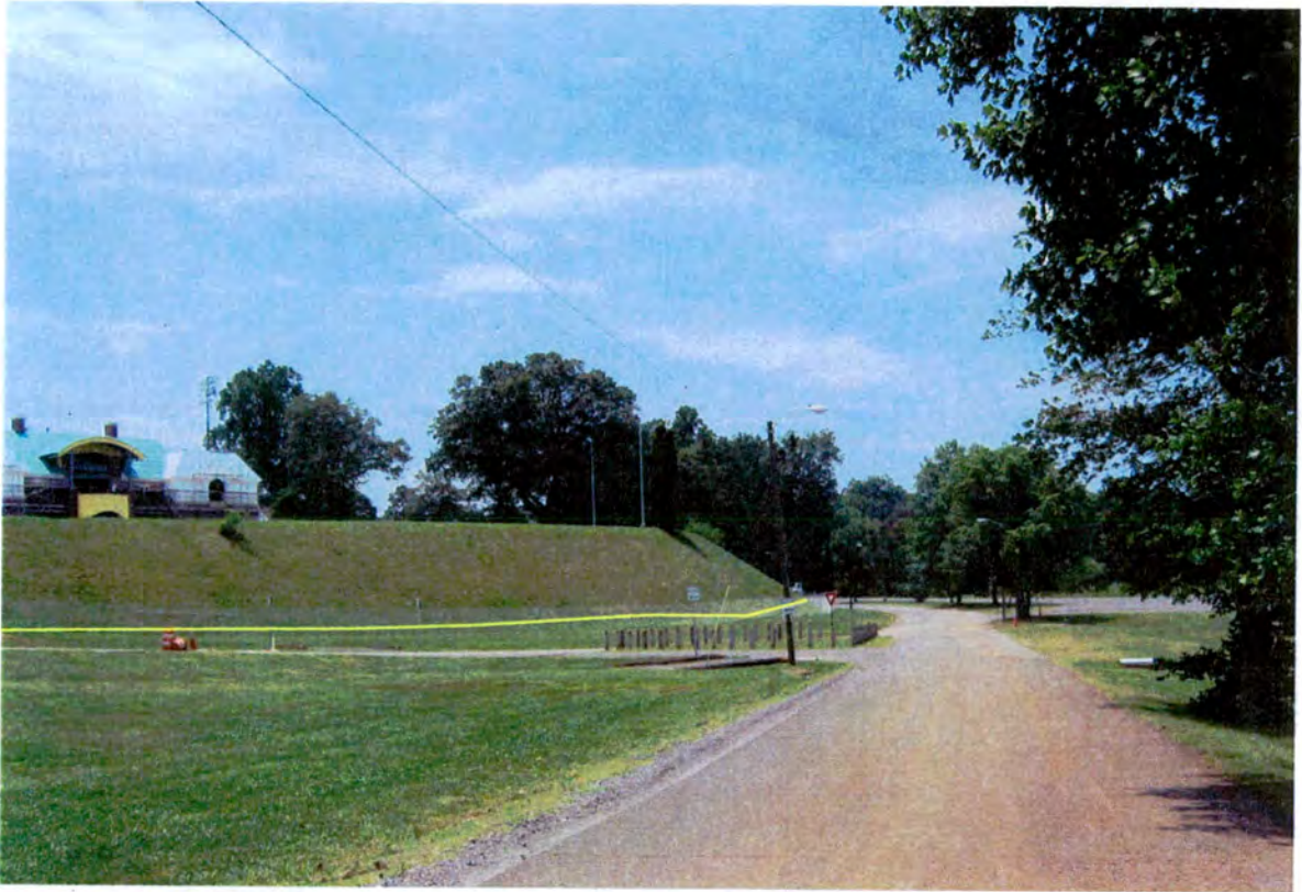
Figure 9: Facing west along Diggs Boulevard with the north slope of the bank between the stadium and floodplain to the left (south); revised boundary is yellow