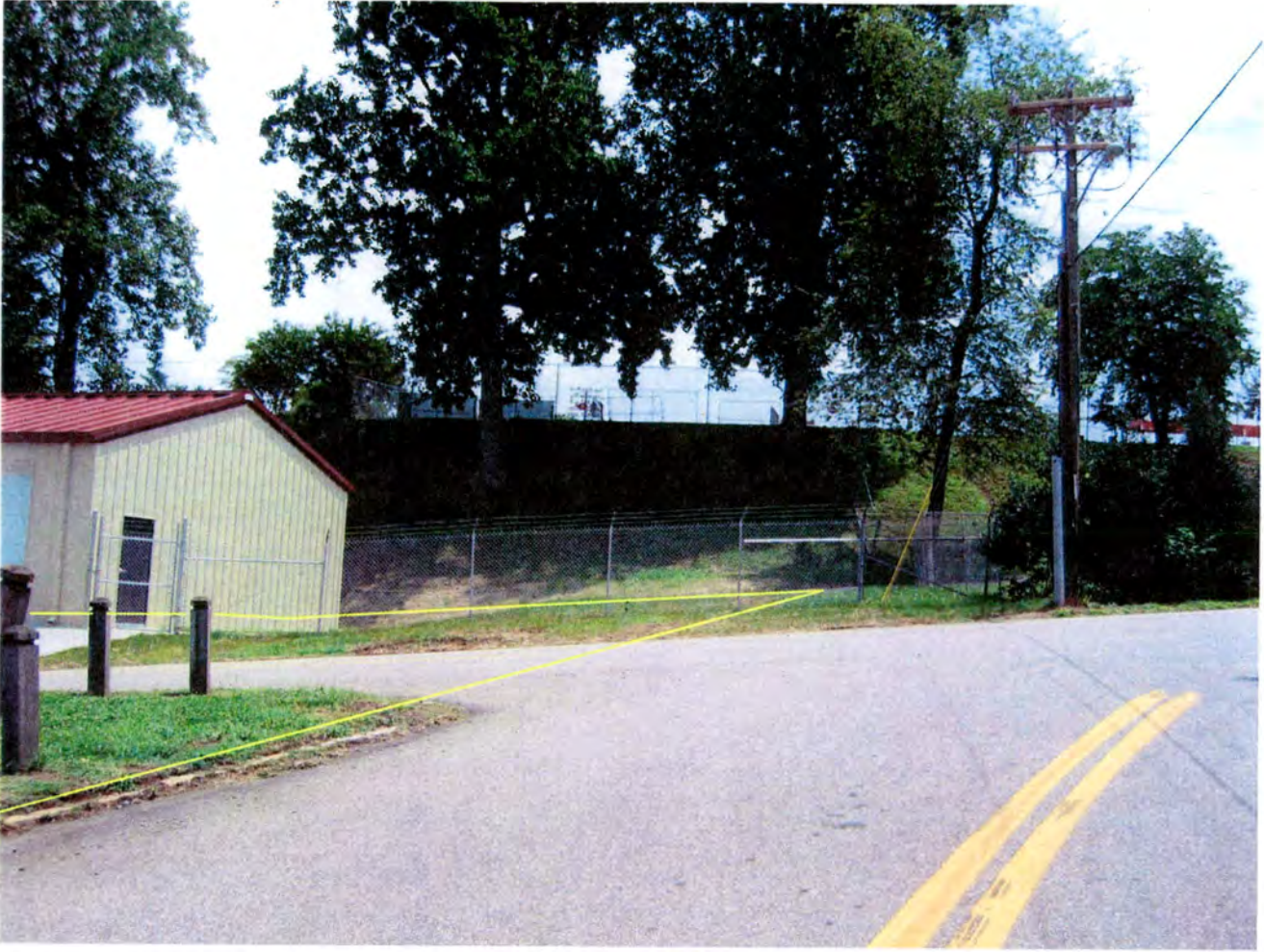
Figure 17: Facing east from Diggs Boulevard showing revised west boundary in yellow