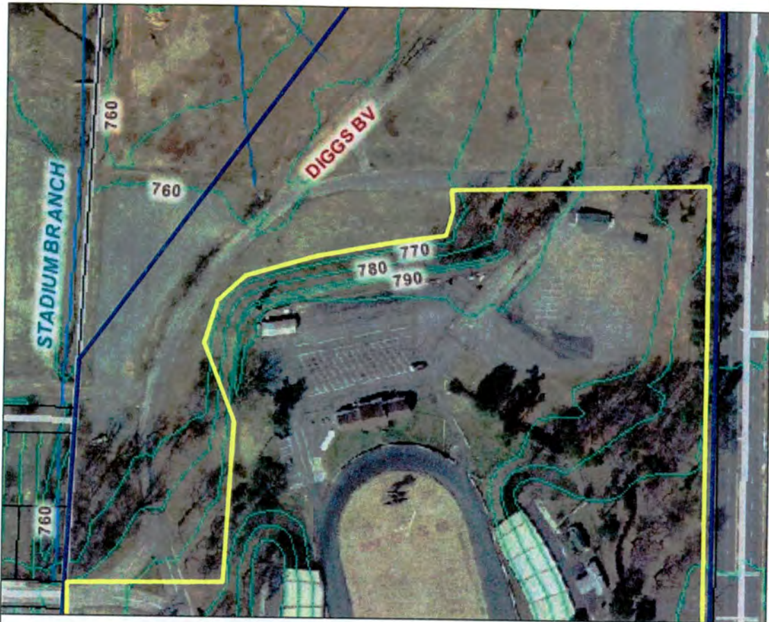
Detail of Revisions to the Northern Edge of the National Register Eligible Boundary of Bowman Gray Memorial Stadium Showing Topographic Lines