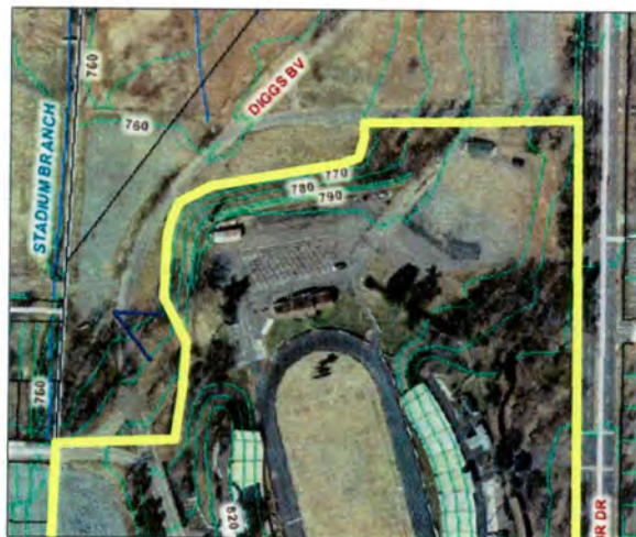
Figure 16: Map indicating direction photographer was facing; photographer was standing at the point of the V