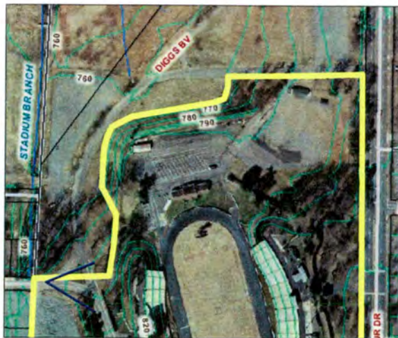
Figure 18: Map indicating direction photographer was facing; photographer was standing at the point of the V