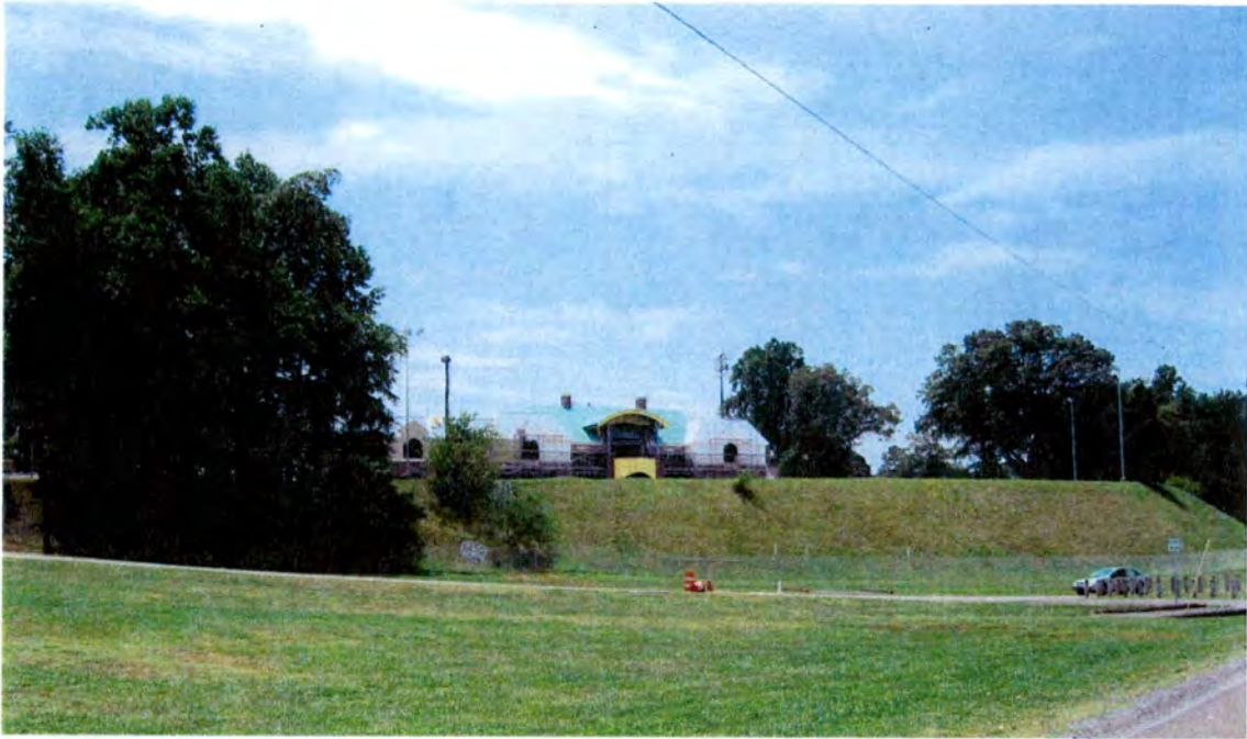
Figure 7: Facing the north slope of the bank between the stadium and floodplain