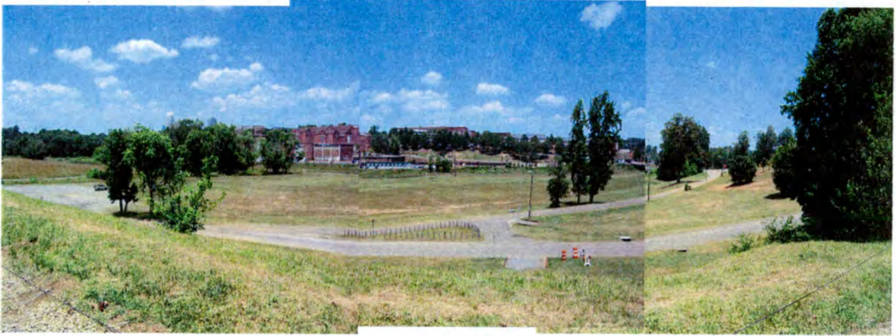
Figure 21: Collage showing view from top of bank at the proposed revised boundary's northern edge, facing north and looking over Diggs Boulevard and Salem Creek floodplain towards Winston-Salem State University