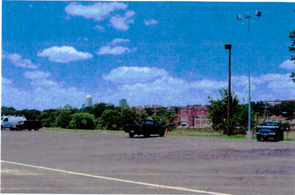
Figure 22: Facing northwest from north side of fieldhouse