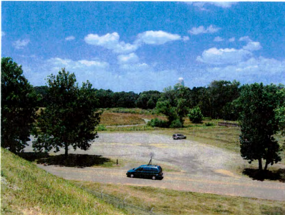
Figure 20: Facing northwest from top of bank at the proposed revised boundary's northwest corner