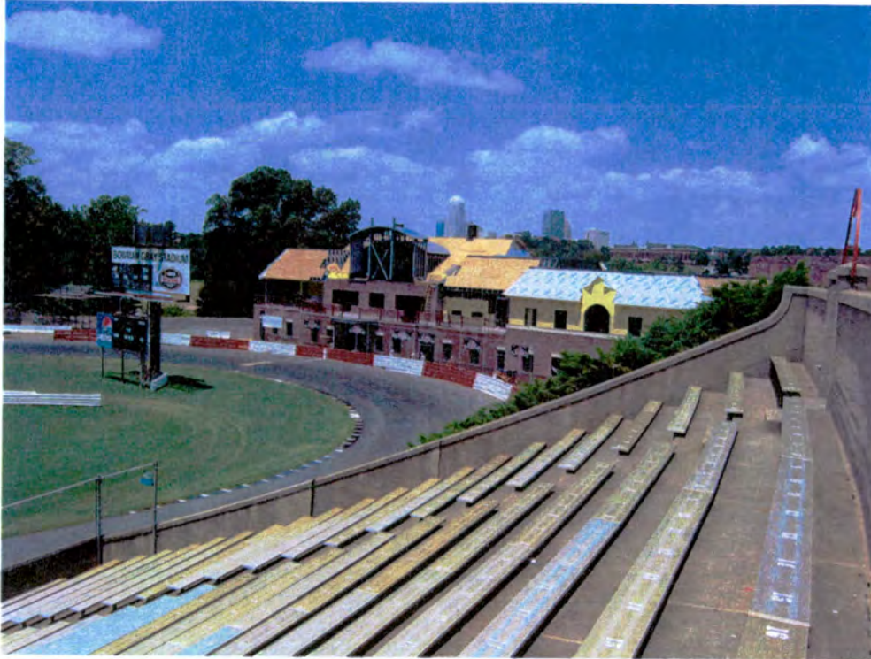
Figure 24: Facing northwest from stadium