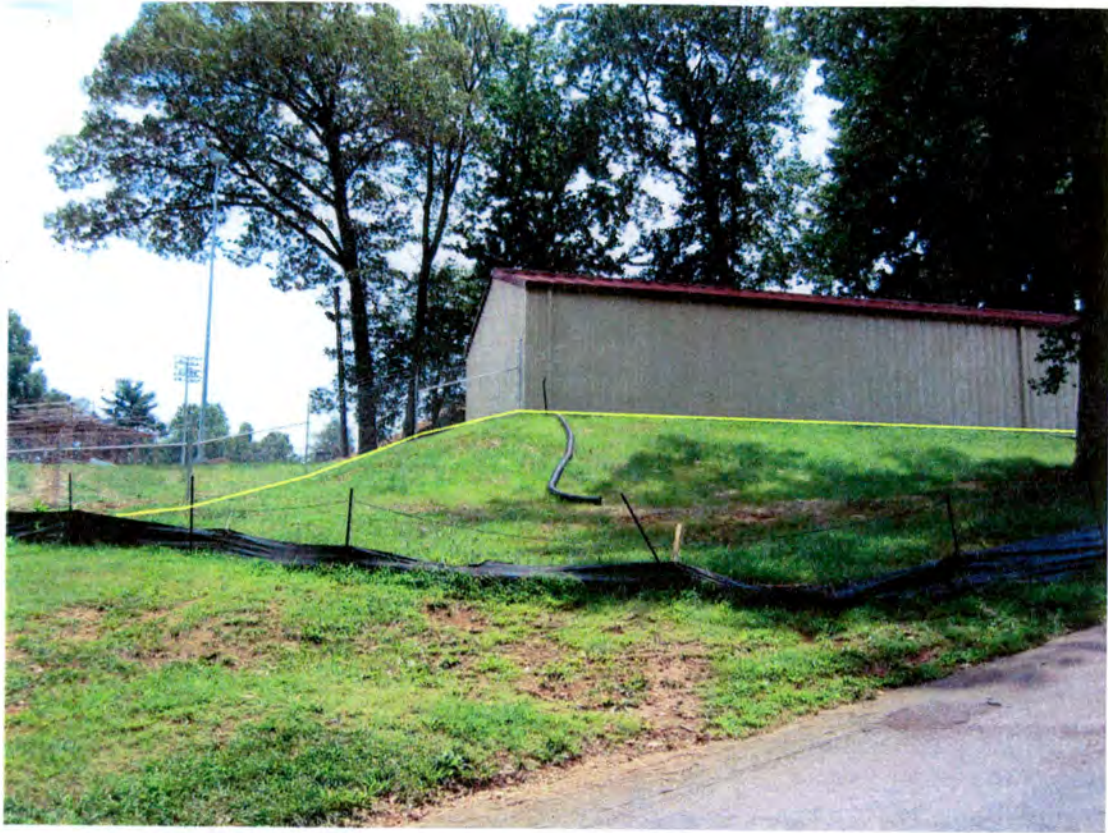
Figure 15: Facing southeast from Diggs Boulevard showing revised west boundary in yellow