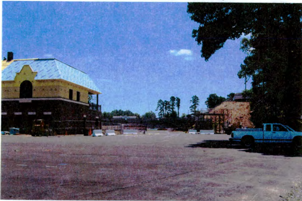
Figure 23: Facing south-southeast into stadium with northwest corner of fieldhouse in the left side of the image