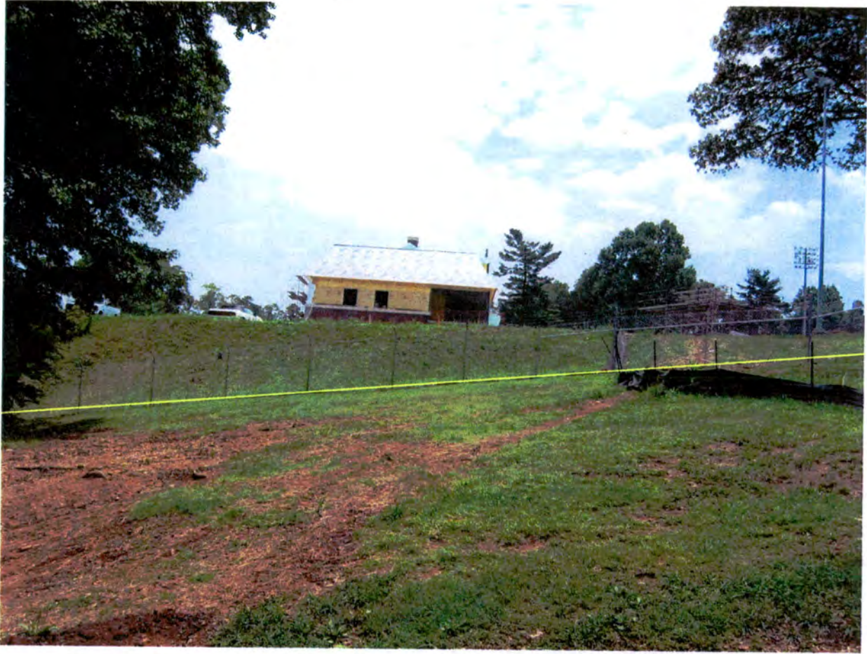
Figure 13: Facing east from Diggs Boulevard showing revised west boundary in yellow