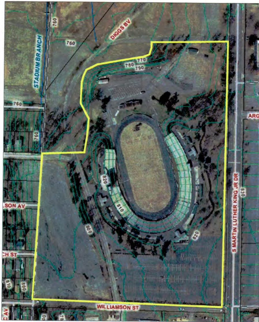
Revised Bowman Gray Memorial Stadium National Register Boundary Showing Topographic Lines