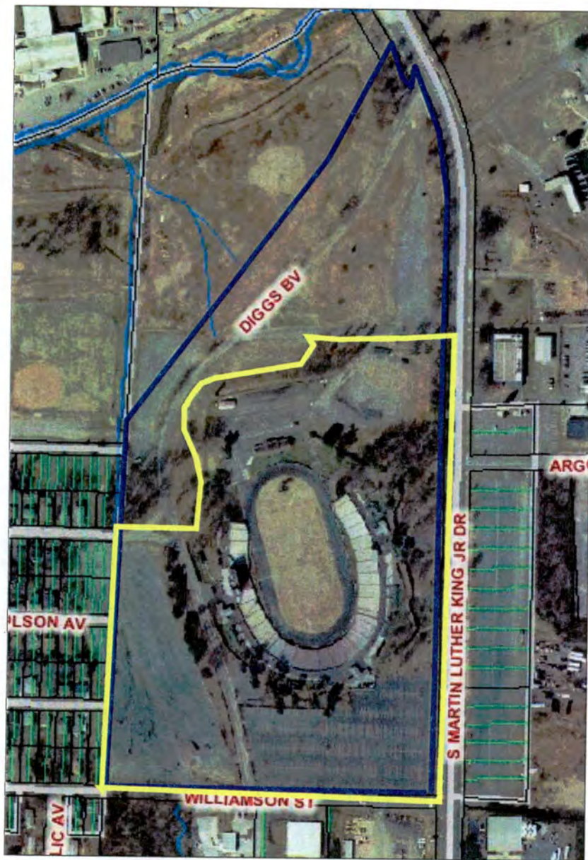
Revised Bowman Gray Memorial Stadium National Register Boundary