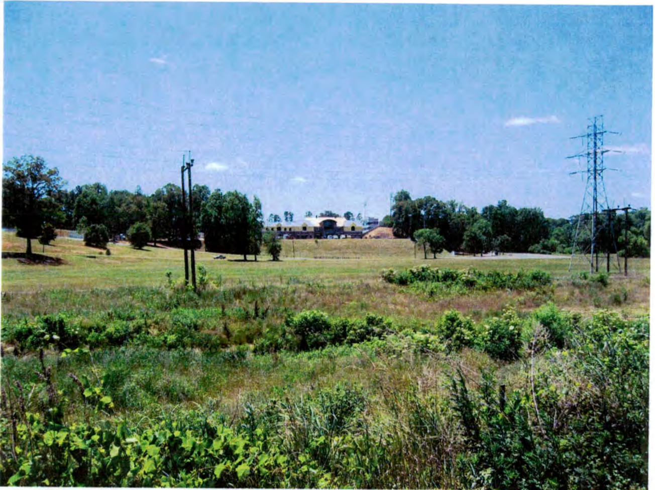
Figure 5: Facing south across Salem Creek floodplain showing the fieldhouse's north elevation