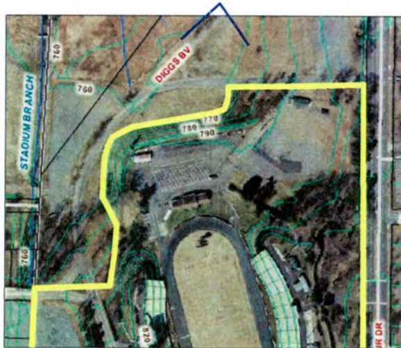
Figure 8: Map indicating direction photographer was facing; photographer was standing at the point of the V