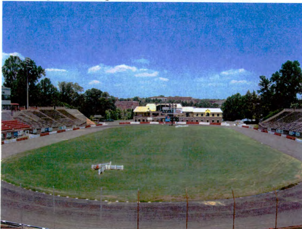
Figure 25: Facing north-northwest towards fieldhouse