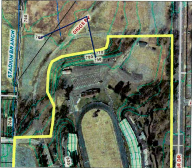
Figure 10: Map indicating direction photographer was facing; photographer was standing at the point of the V