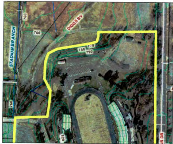
Figure 14: Map indicating direction photographer was facing; photographer was standing at the point of the V