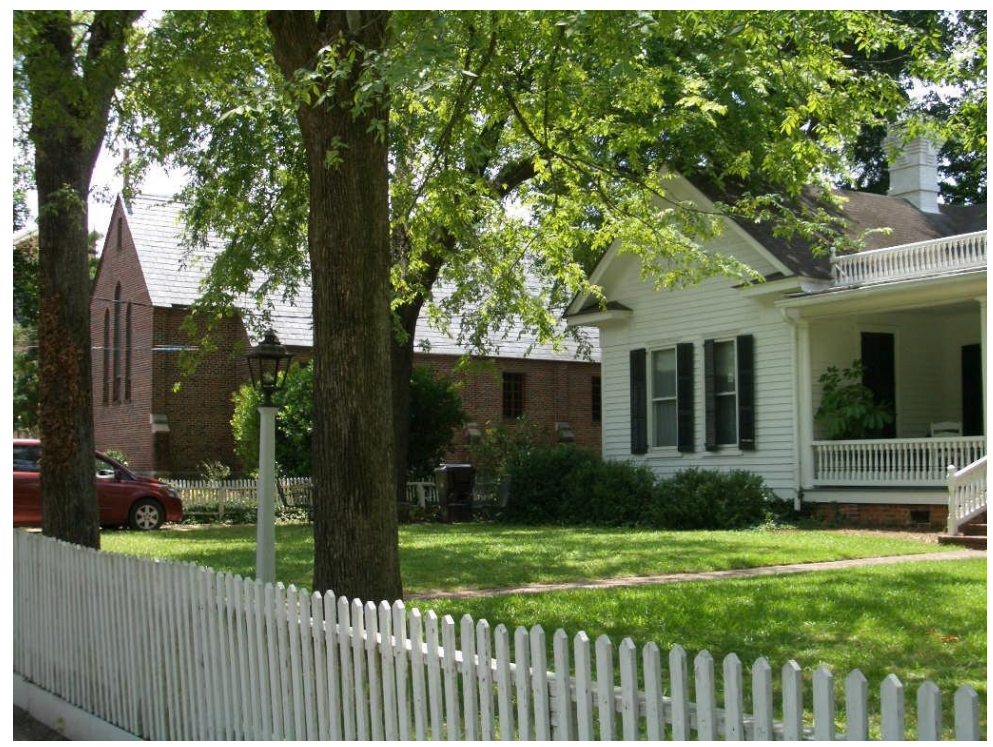
McMillan-Rankin House, 110 Bradford Avenue and St. Patrick's Catholic Church, 802 Arsenal Avenue