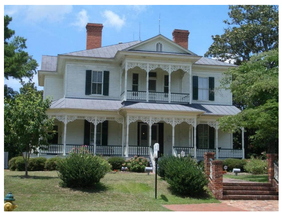
Edgar Allen Poe House, 206 Bradford Avenue