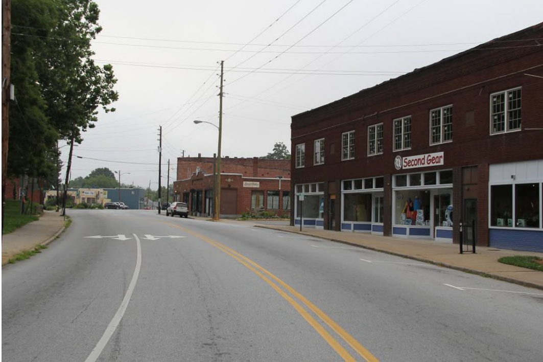
View toward the original historic district