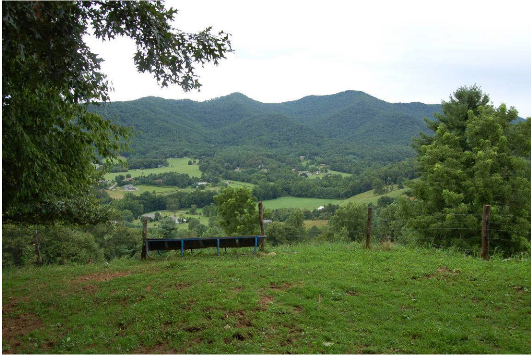
View north from farm hillside