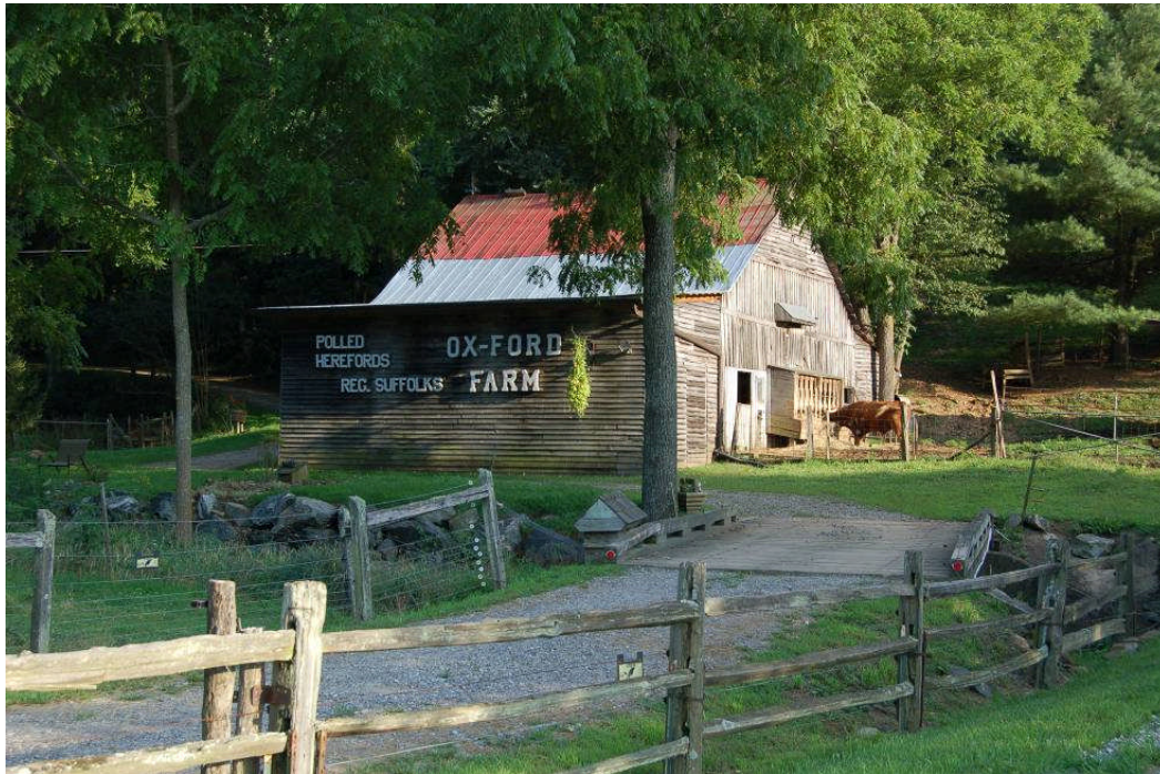
View from road with barn

Photographs by Laura A. W. Phillips, July 2012