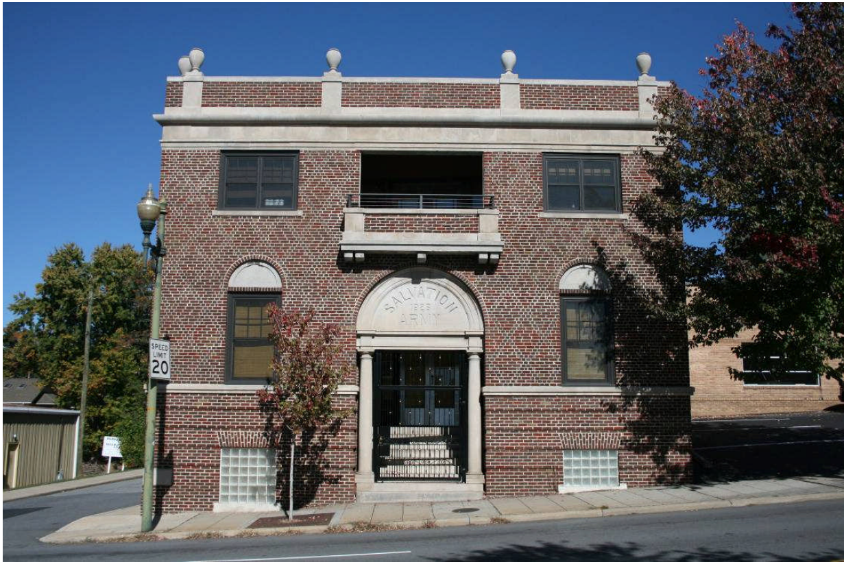
Salvation Army Building, 175 Patton Avenue