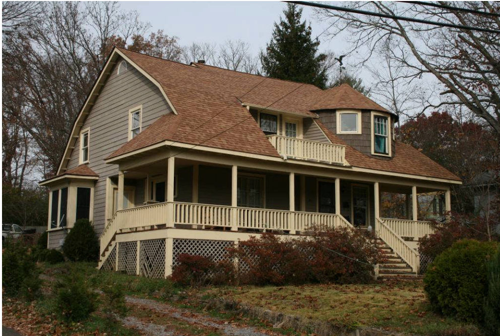
307 South Montreat Road

Photographs by Clay Griffith, November 2009