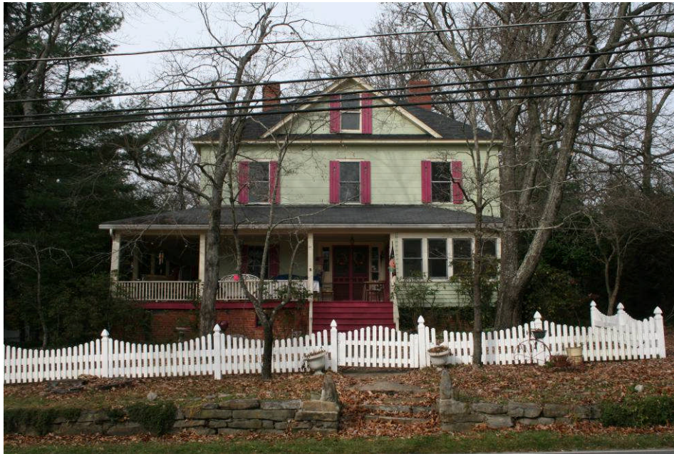
303 South Montreat Road