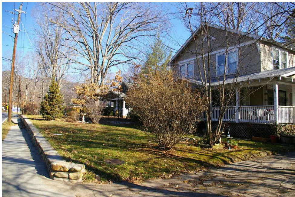
South Montreat Road, east side looking north