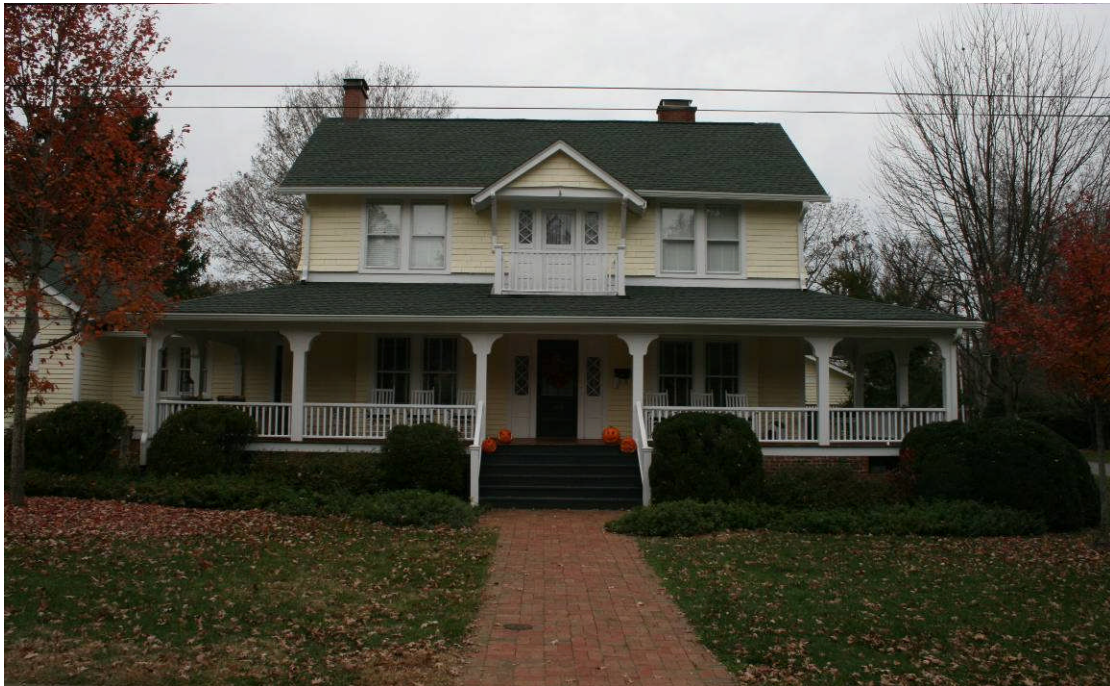
Conley Dougherty House, 309 North Dougherty Street