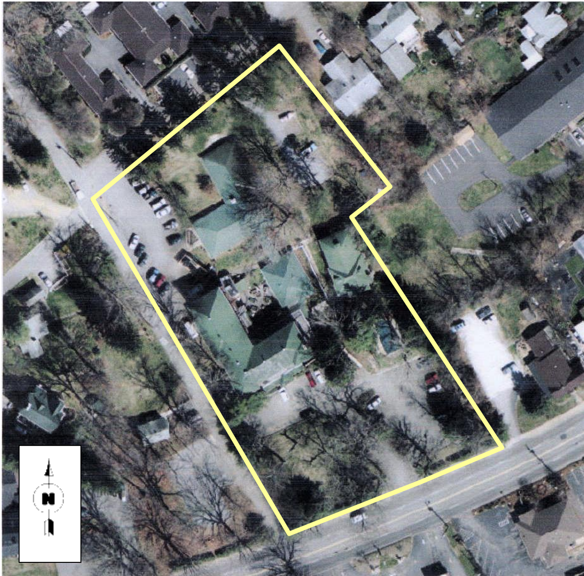
Monte Vista Hotel – National Register Boundary Map Tax Parcel PIN 0619-09-25-2462

(Source: Buncombe County Land Records Department)