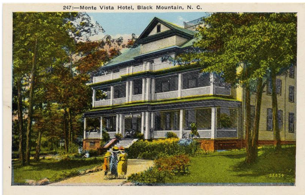
Monte Vista Hotel (original building), Postcard View, ca. 1920

Lucien and Rosalie Phillips opened their new establishment, the Monte Vista Hotel, in 1919, as the Town of Black Mountain was evolving into a significant tourist destination and the second largest municipality in Buncombe County behind Asheville. Originally from South Carolina, the Phillipses enjoyed visiting Black Mountain to participate in Methodist Church activities. When they relocated, the couple understood that there was to be a Methodist colony established in Black Mountain, which ultimately did not materialize. The Phillipses nevertheless decided to stay and bought the old school building and one-acre lot at the northeast corner of State Street and New Bern Avenue for $3,350. At the time, the Cauble House and Gresham Hotel were operated a short distance to the southeast across State Street, although the Gresham Hotel was only open for four months of the year during the early 1920s. The Monte Vista Hotel contained twenty-six guest rooms and sixteen baths, and its wide porch provided scenic mountain views across the valley to the south. The family-run Monte Vista possessed a relaxing homelike atmosphere, and the Phillipses raised their own hogs and chickens, cured their hams and other meat, grew vegetables, and kept a small dairy. 9