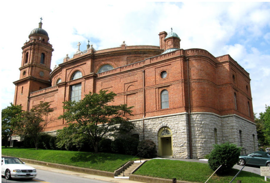
Side and rear view