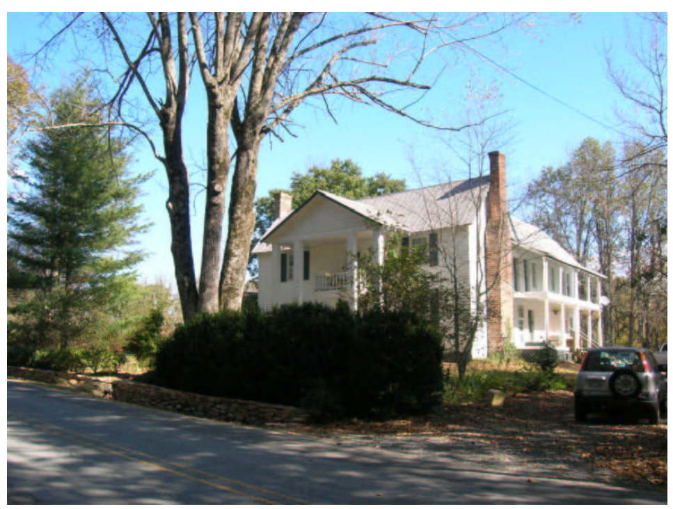
Overall view from road.