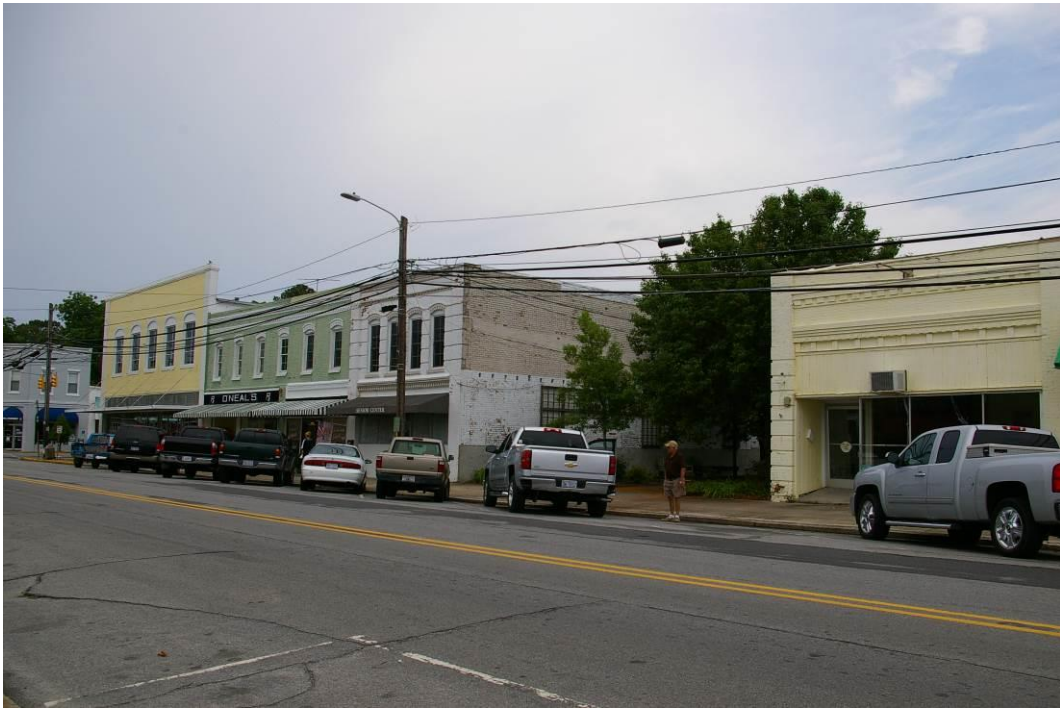
East Main Street, looking southeast