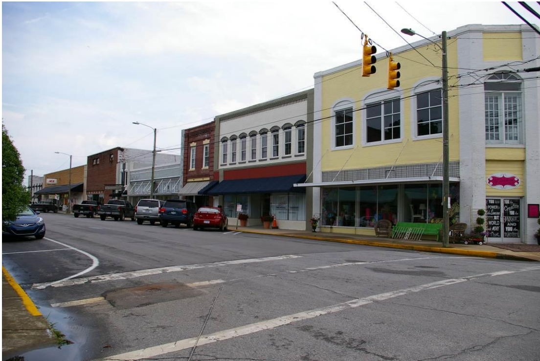
Pamlico Street, west side

Photographs by Sybil Argintar, June 2014