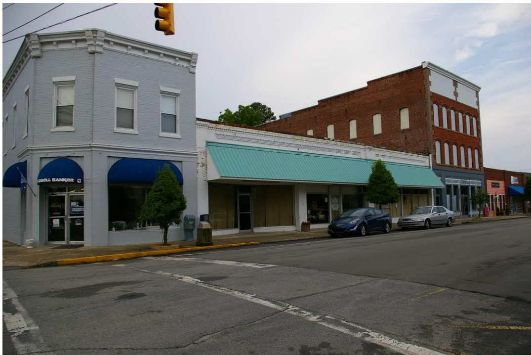
Pamlico Street, east side