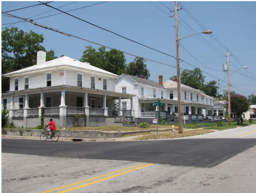
700 Block of North Market Street, west side

March 2010