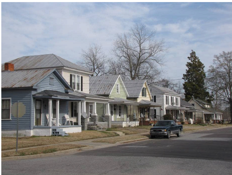
200 Block of East Seventh Street, north side