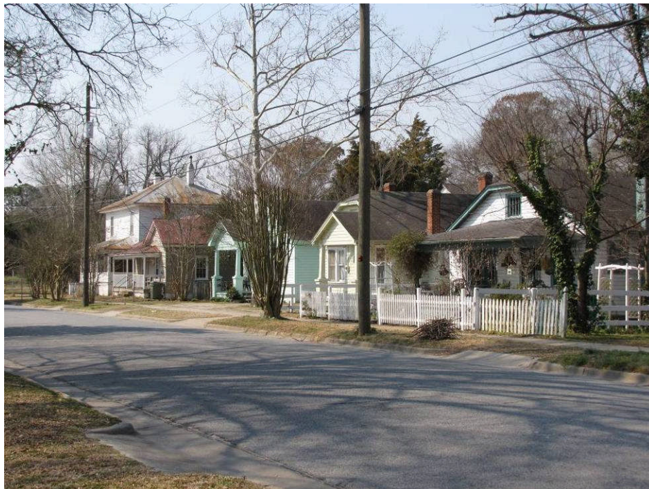
600 Block of North Bonner Street, west side