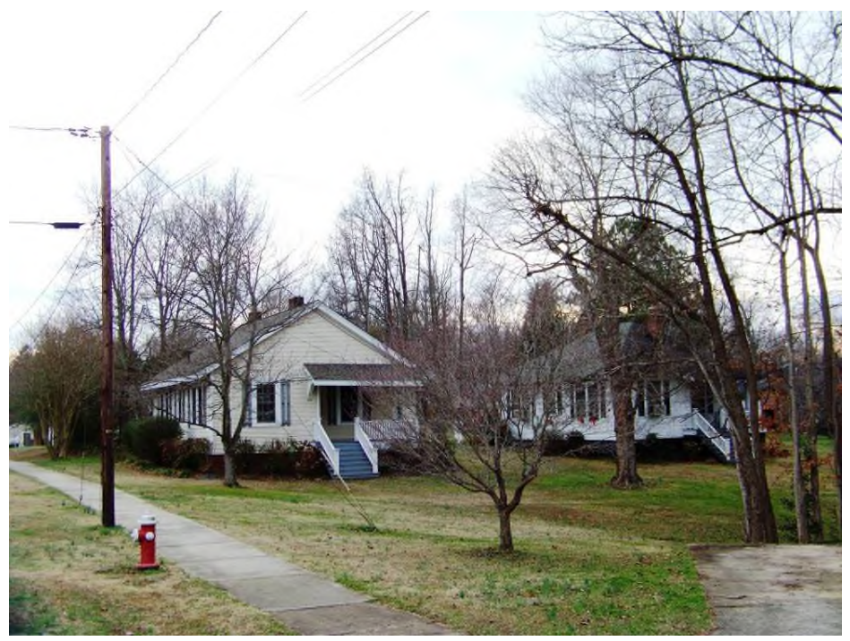
West McKinley Street