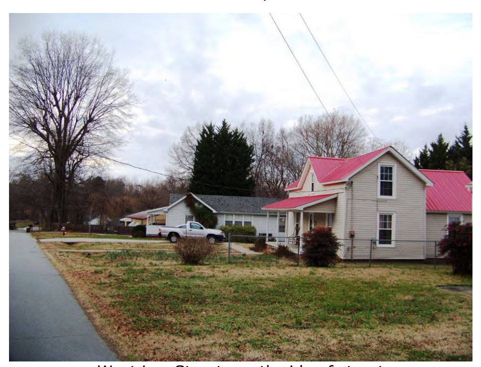
West Lee Street, north side of street