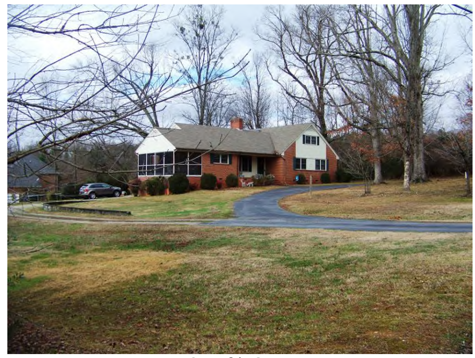
734 Fifth Street