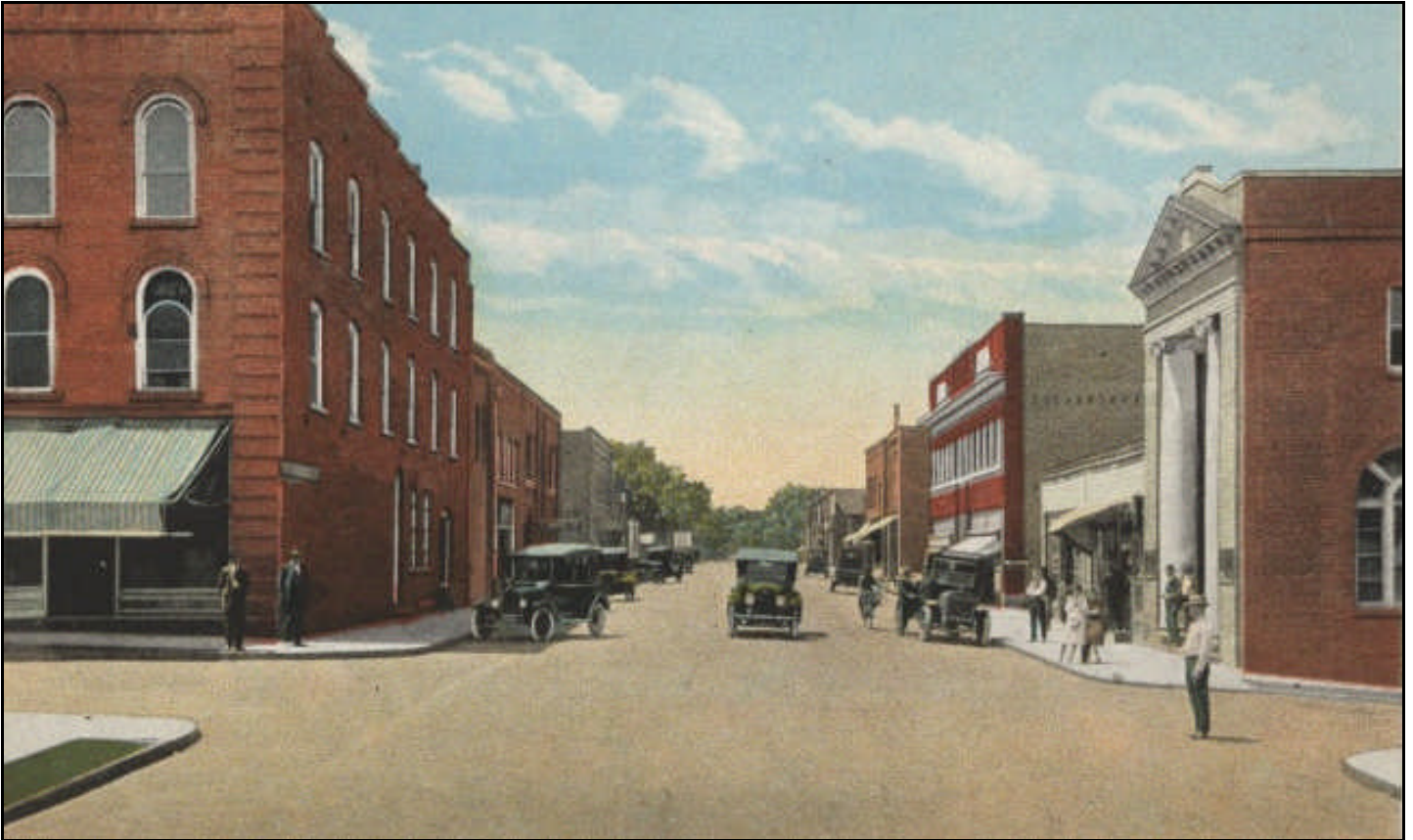
Figure 3 This 1920s post card view of W. Clay Street illustrates the 1910 bank building at 100 W. Clay Street on the right and the Jones Department Store at 113-113 N. Fourth Street on the left, and demonstrates the built-up character of the streetscape by that time.