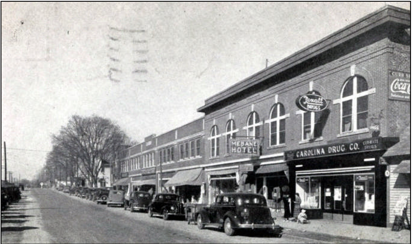
Figure 1 This c. 1935 post card view of East Center Street illustrates the Mebane Hotel building at 105-111 East Center Street, followed by the Five Star Building at 103-105 East Center Street