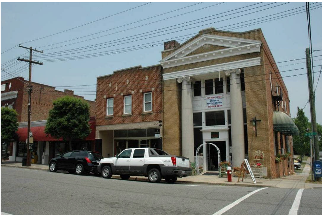
West Clay Street, north side