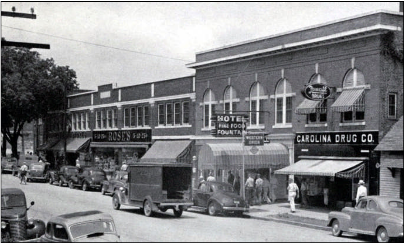
Figure 2 This post card view from the late 1940s shows the Mebane Hotel building at 105-111 East Center Street and the Five Star Building at 103-105 East Center Street when the latter housed Rose's 5 & 10 store.