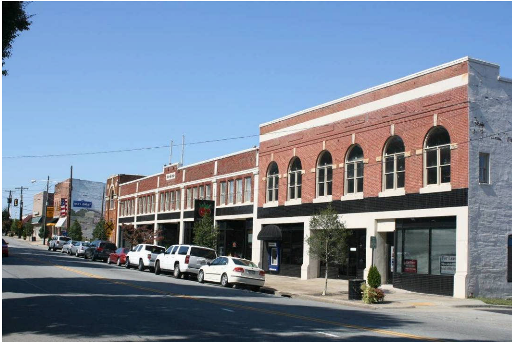
East Center Street, looking northwest