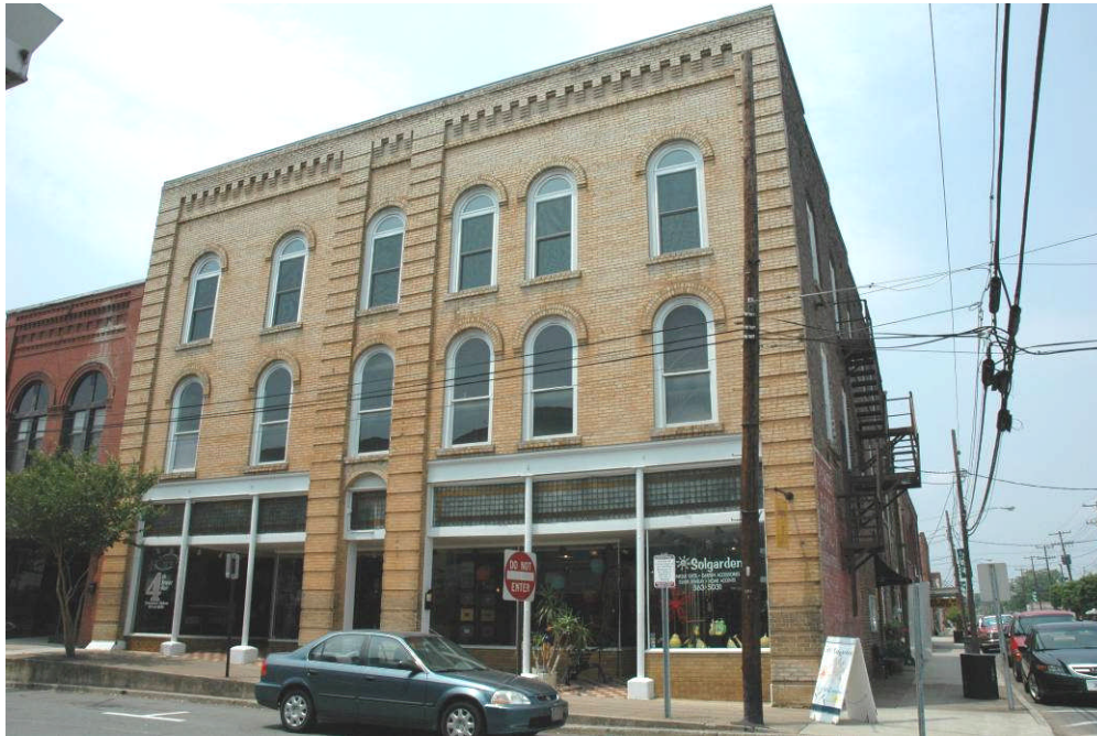
Jones Department Store Building, North Fourth Street