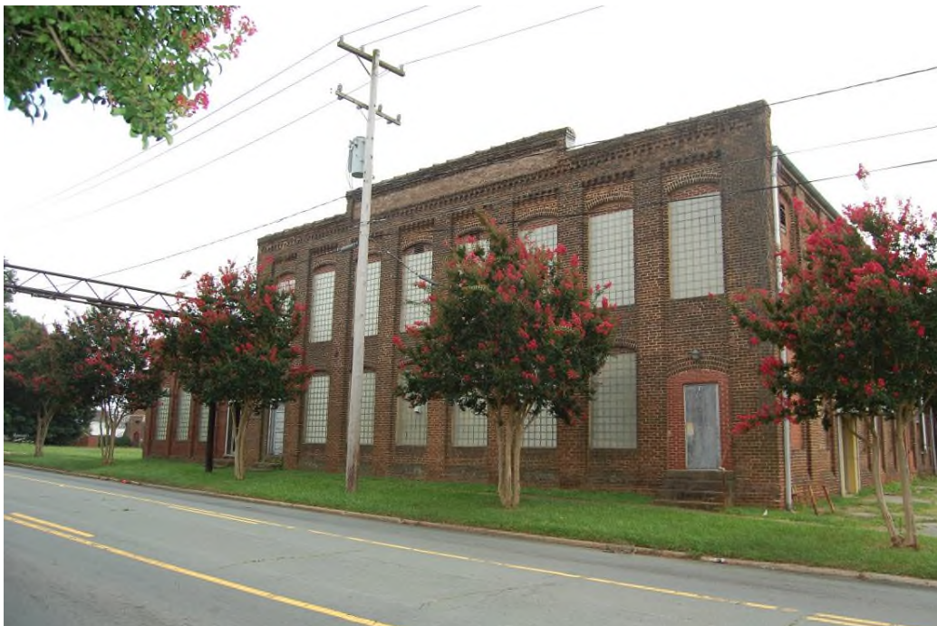
Scott-Mebane Manufacturing Company