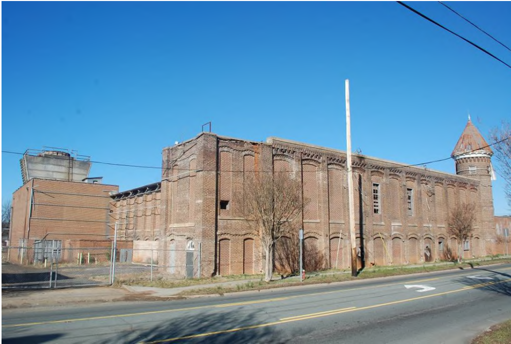
Oneida Cotton Mills, looking northeast (2014)